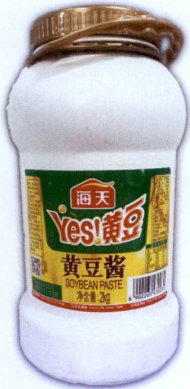
Figure 4. Unregistered YES Soybean Paste (In Foreign Language)