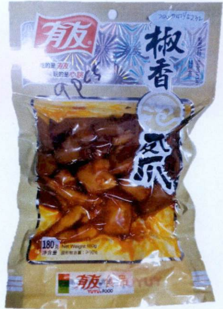
Figure 3. Unregistered YUYU FOOD Marinated Chicken Feet in Beige Color with Vacuumed Sealed Foil Pack (In Foreign Language)