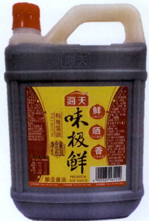
Figure 5. Unregistered Premium Soy Sauce (In Foreign Language)