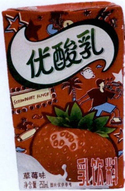
Figure 2. Unregistered Drink in Carton Box with Red and White Label with Image of Strawberry (In Foreign Language)