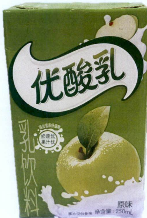
Figure 1. Unregistered Drink in Carton Box with Green and White Label with Image of Green Apple (In Foreign Language)

The Food and Drug Administration (FDA) warns all healthcare professionals and the general public NOT TO PURCHASE AND CONSUME the following unregistered food products: