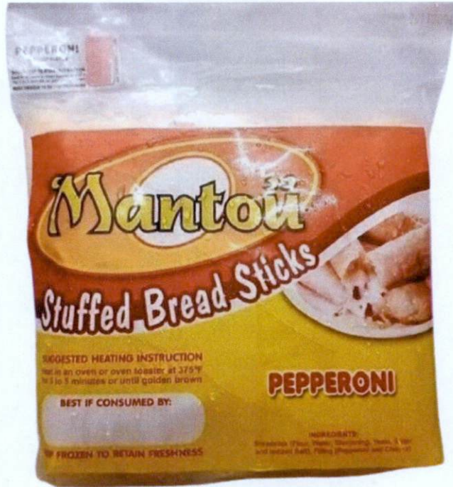
Figure 4. Unregistered MANTOU Stuffed Bread Sticks – Pepperoni