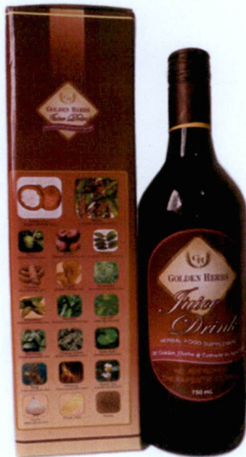
Figure 3. Unregistered GOLDEN Herbs Juice Drink