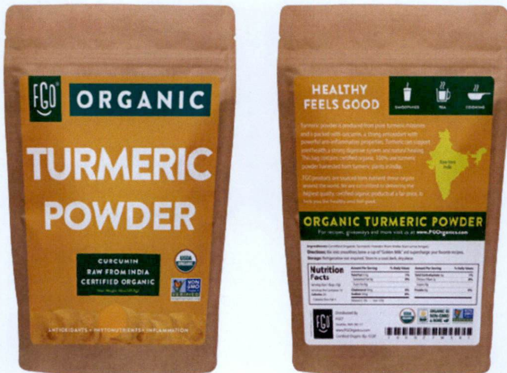
Figure 5. Unregistered FEEL GOOD Organic Turmeric Powder