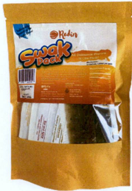
Figure 2. Unregistered RADIN SWAK PACK Special Guinamos in Sachets