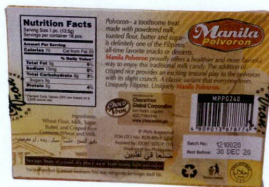
Figure 1. Unregistered MANILA POLVORON Original Powdered Milk Candy Pinipig (Crisped Rice)