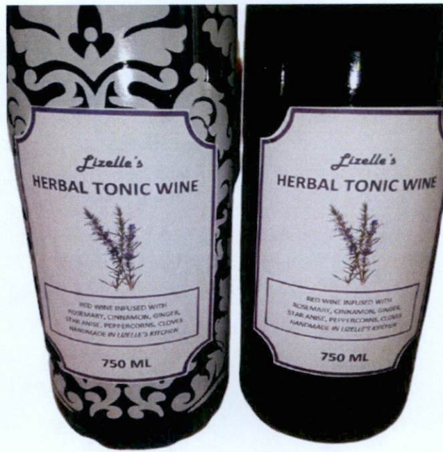
Figure 4. Unregistered LIZELLE'S Herbal Tonic Wine