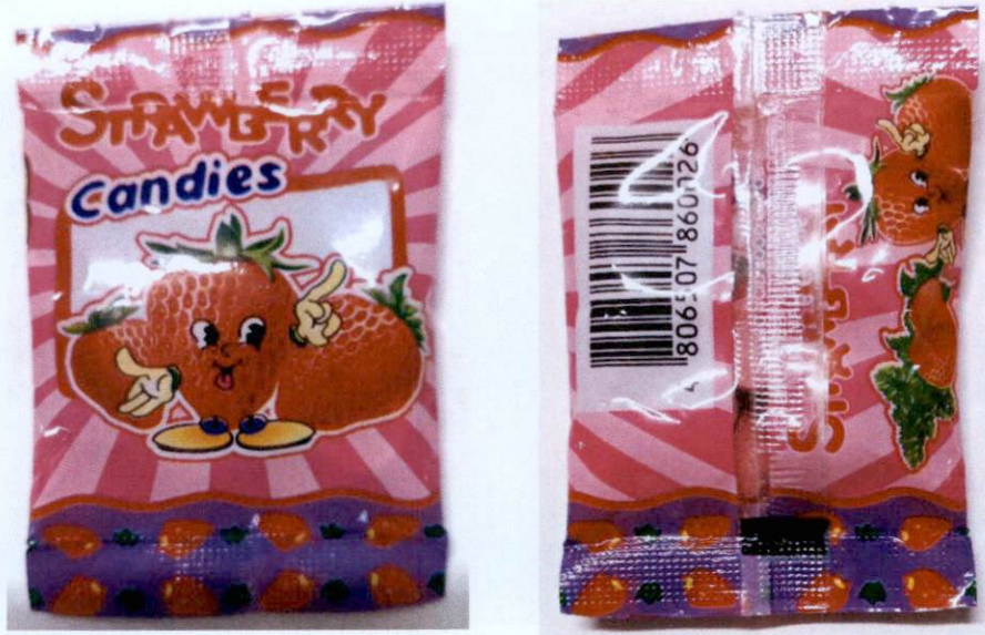
Figure 2. Unregistered Strawberry Candies