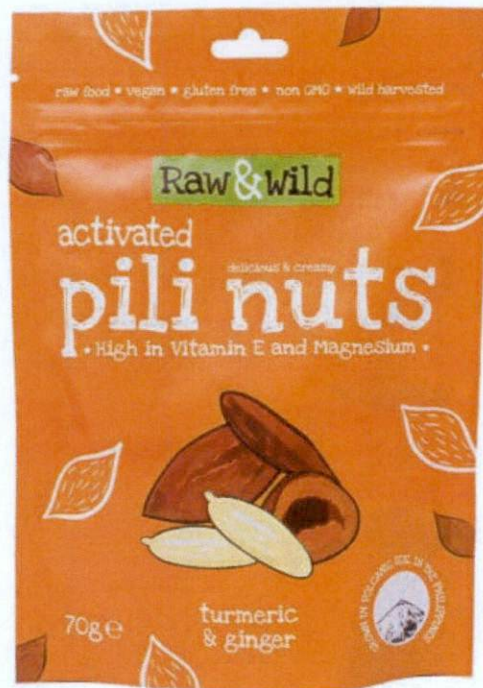
Figure 5. Unregistered RAW & WILD Activated Pili Nuts Turmeric & Ginger