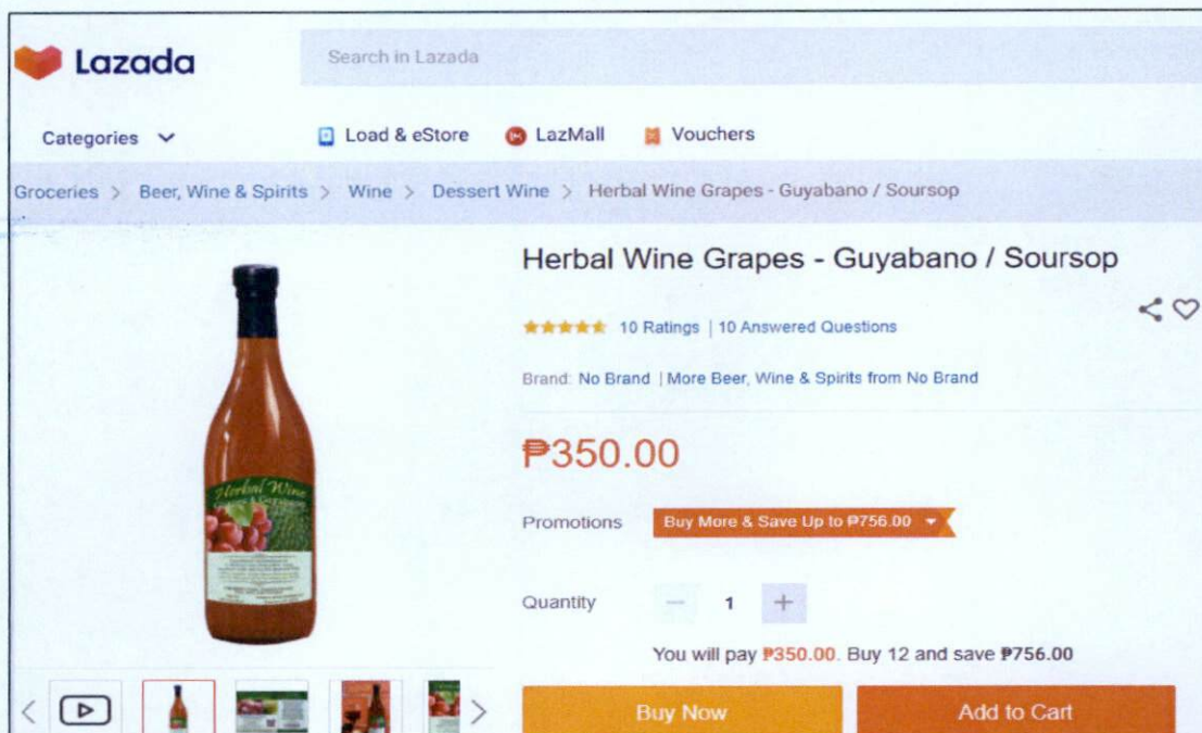
Figure 1. Unregistered HERBAL WINE Grapes & Guyabano

The Food and Drug Administration (FDA) warns all healthcare professionals and the general public NOT TO PURCHASE AND CONSUME the following unregistered food products: