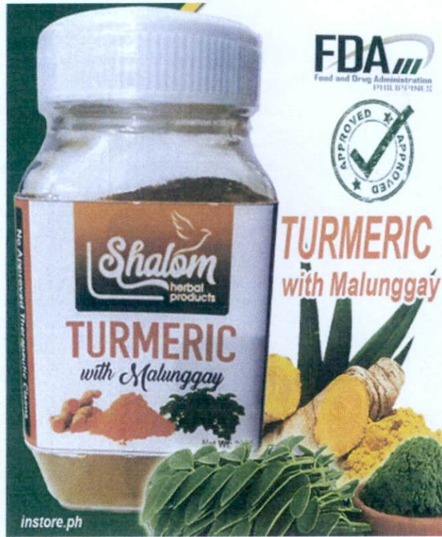
Figure 2. Unregistered SHALOM HERBAL PRODUCTS Turmeric with Malunggay Powder