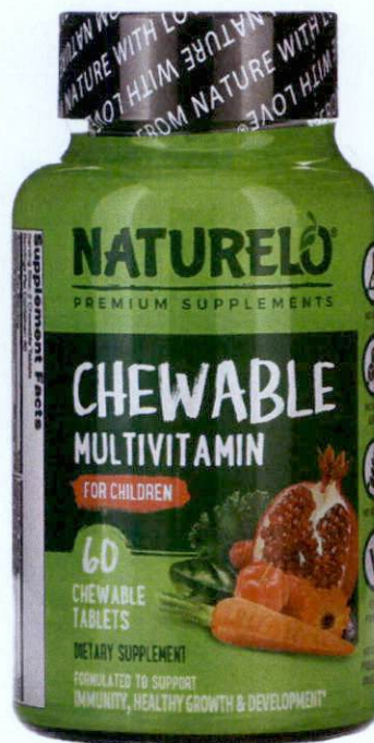
Figure 5. Unregistered NATURELO PREMIUM SUPPLEMENTS Chewable Multivitamin Dietary Supplement