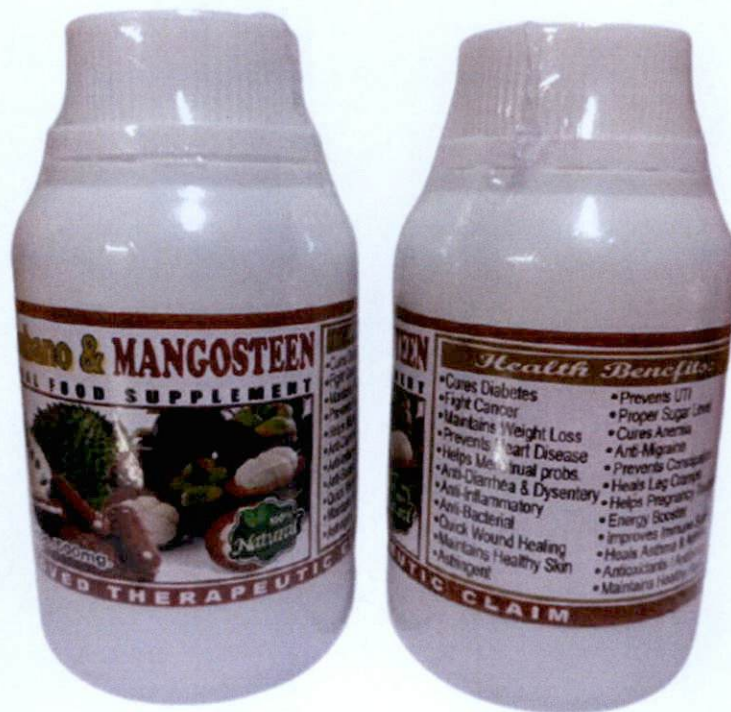
Figure 3. Unregistered Guyabano & Mangosteen Herbal Food Supplement