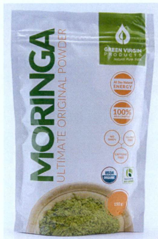
Figure 1. Unregistered GREEN VIRGIN PRODUCTS Moringa Ultimate Original Powder

The Food and Drug Administration (FDA) warns all healthcare professionals and the general public NOT TO PURCHASE AND CONSUME the following unregistered food products and food supplements: