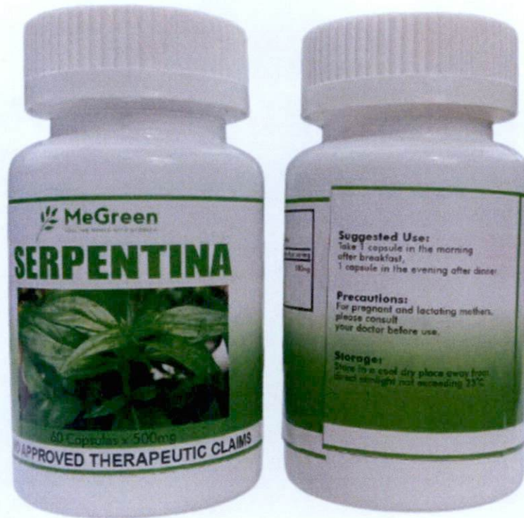
Figure 4. Unregistered MEGREEN Serpentina Capsules