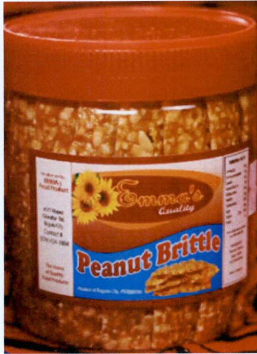
Figure 2. Unregistered EMMA'S QUALITY Classic Peanut Brittle