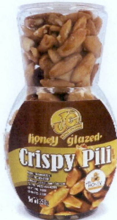
Figure 1. Unregistered JC PILI CENTER Honey Glazed Crispy Pili

The Food and Drug Administration (FDA) warns all healthcare professionals and the general public NOT TO PURCHASE AND CONSUME the following unregistered food products: