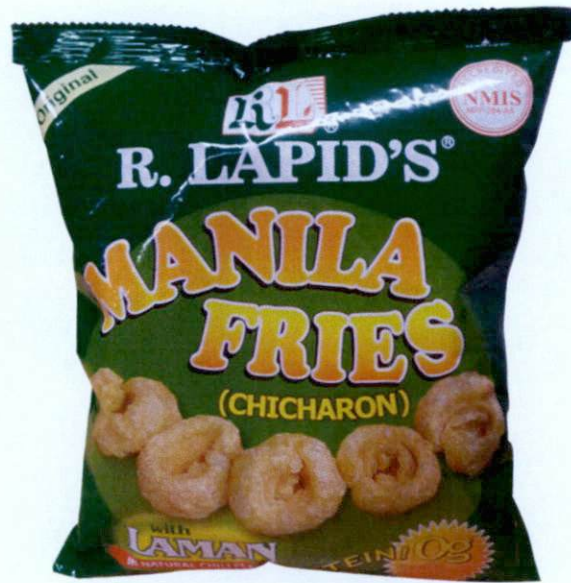
Figure 2. Unregistered R.LAPID'S Manila Fries (Chicharon) with laman