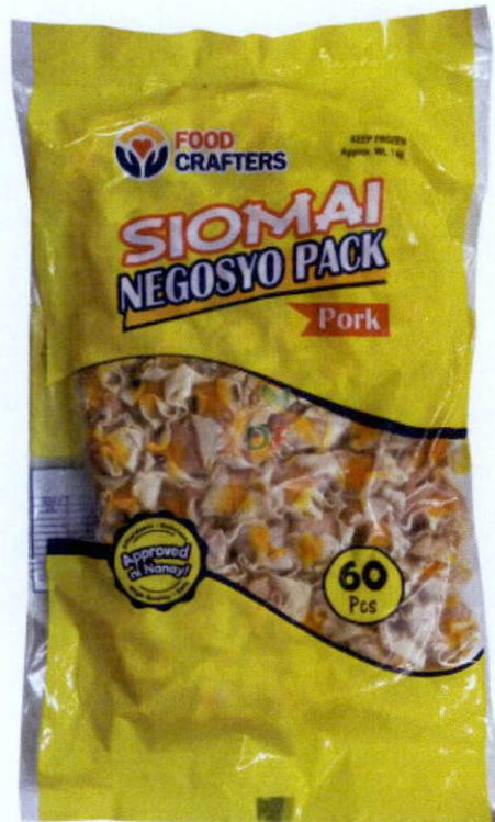
Figure 1. Unregistered FOOD CRAFTERS NEGOSYO PACK Pork Siomai

The Food and Drug Administration (FDA) warns all healthcare professionals and the general public NOT TO PURCHASE AND CONSUME the following unregistered food products: