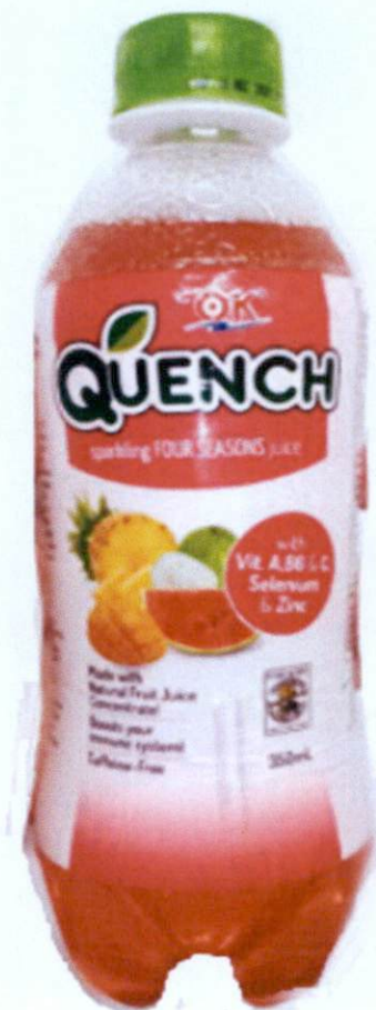
Figure 3. Unregistered OK QUENCH Sparkling Four Seasons Juice