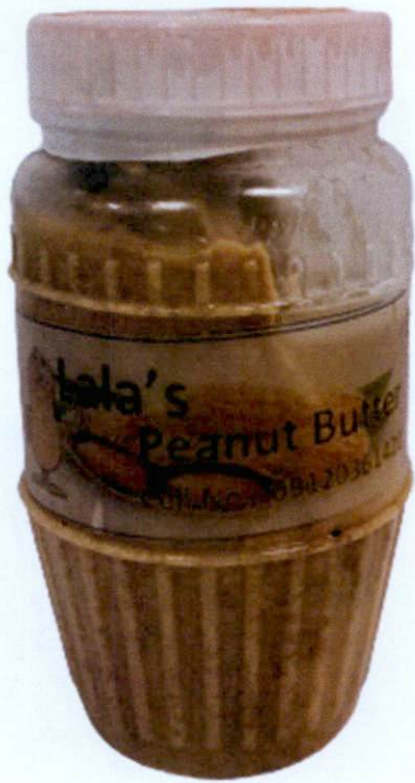
Figure 4. Unregistered LALA'S Peanut Butter