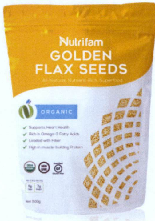
Figure 2. Unregistered NUTRIFAM Golden Flax Seeds