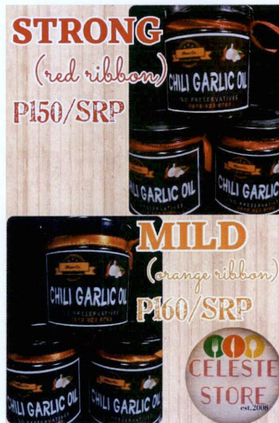
Figure 1. Unregistered CELESTE STORE FROZEN FOOD PRODUCTS Chili Garlic Oil - Strong

The Food and Drug Administration (FDA) warns all healthcare professionals and the general public NOT TO PURCHASE AND CONSUME the following unregistered food products: