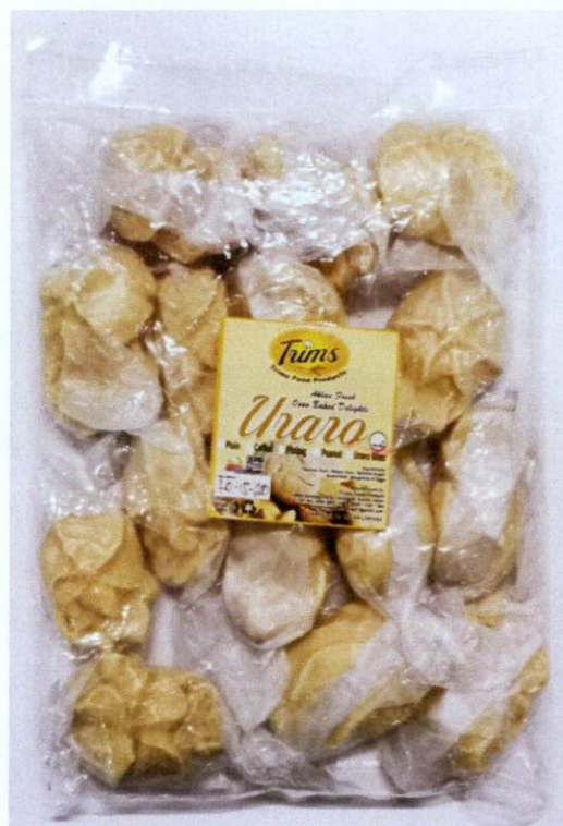
Figure 3. Unregistered TRIMS Uvaro