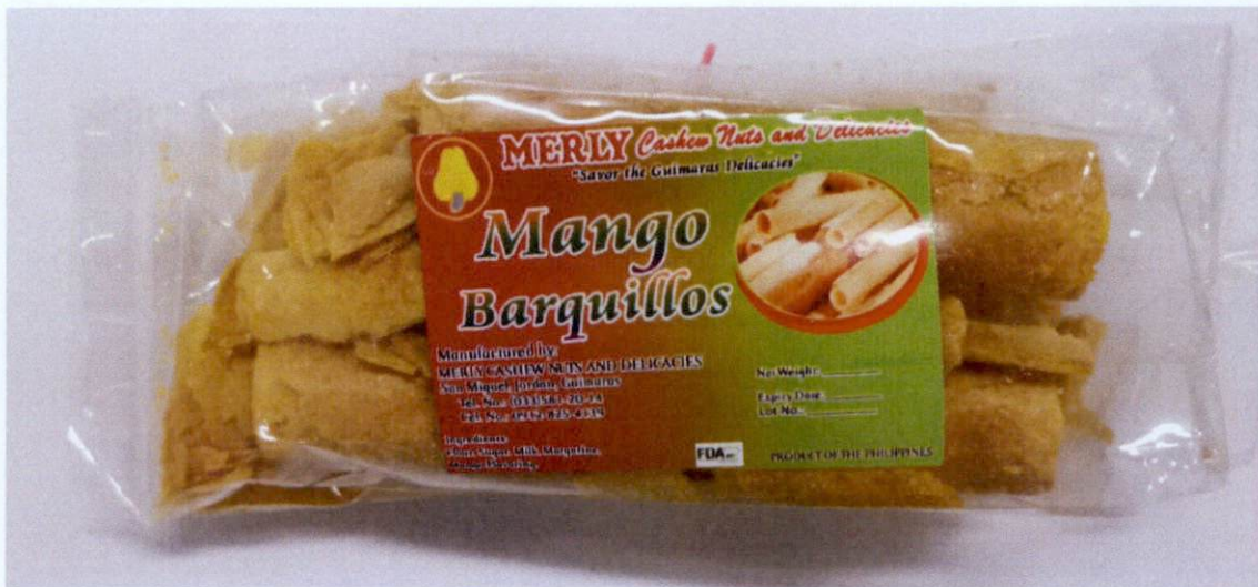
Figure 5. Unregistered MERLY CASHEW AND NUTS DELICACIES Mango Barquillos