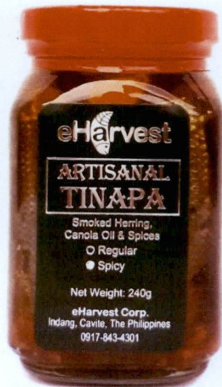
Figure 5. Unregistered EHARVEST Artisanal Tinapa Smoked Herring, Canola Oil & Spices, Spicy