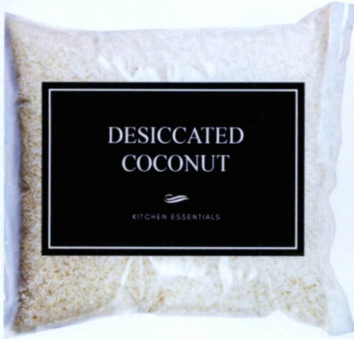
Figure 2. Unregistered KITCHEN ESSENTIALS Desiccated Coconut