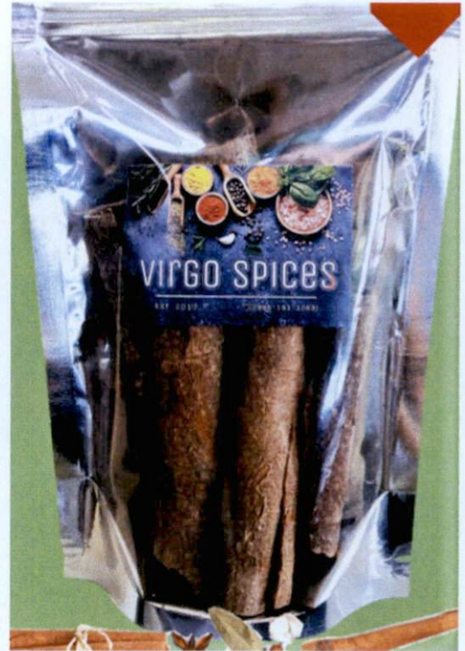
Figure 3. Unregistered VIRGO SPICES Pure Cinnamon Sticks Barks, 100g