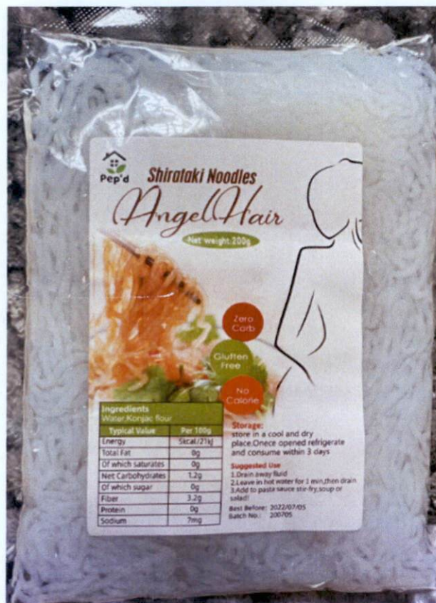
Figure 1. Unregistered PEP' D PRODUCTS Shirataki Noodles, Angel Hair

The Food and Drug Administration (FDA) warns all healthcare professionals and the general public NOT TO PURCHASE AND CONSUME the following unregistered food products: