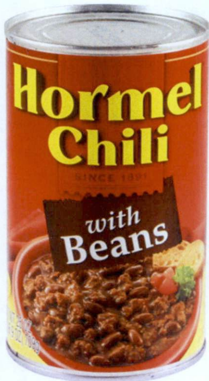
Figure 4. Unregistered HORMEL CHILI with Beans