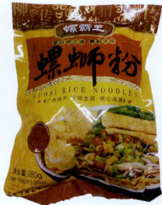
Figure 5. Unregistered Luosi Rice Noodles (in a red and yellow colored plastic packaging) (Labels are in foreign characters)