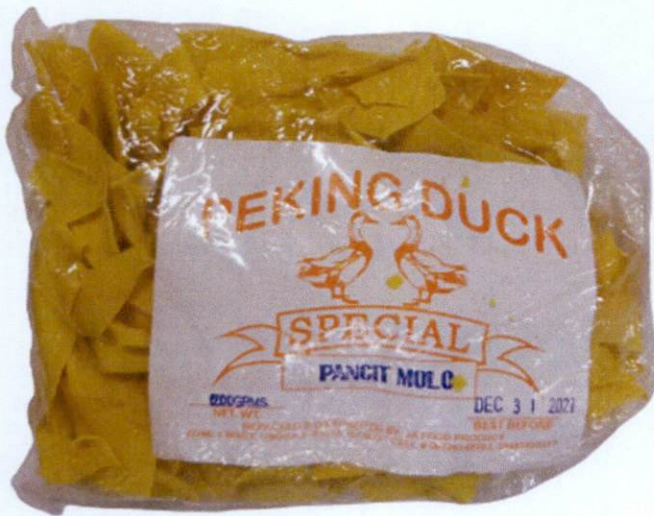
Figure 4. Unregistered PEKING DUCK Special Pancit Molo, 200 g (Labels are in foreign characters)