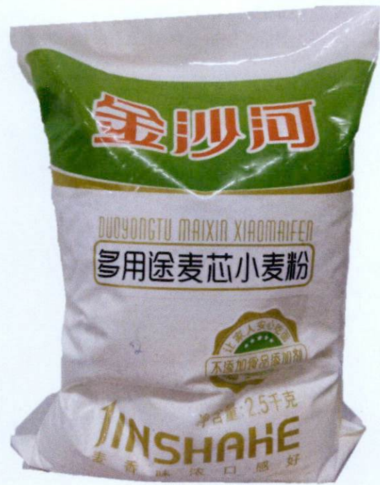
Figure 3. Unregistered JINSHAKE Duoyongtu Maixin Xiaomaifen (in a white plastic packaging with green colored label) (Labels are in foreign characters)