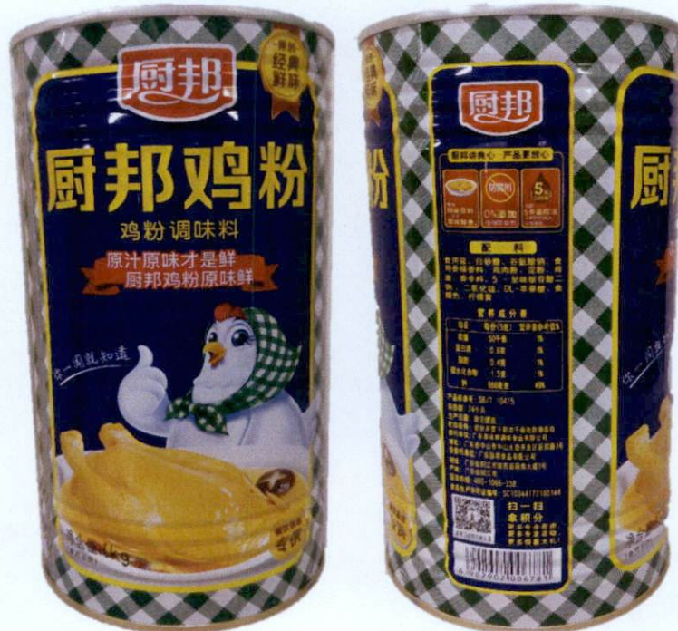
Figure 1. Unregistered Tin Can with Blue and Green Label with Image of Chicken (Labels are in foreign characters)

The Food and Drug Administration (FDA) warns all healthcare professionals and the general public NOT TO PURCHASE AND CONSUME the following unregistered food products: