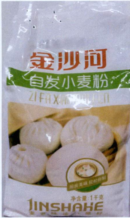
Figure 2. Unregistered JINSHAKE Zi Fa Xiaomaifen (in a white plastic packaging with green colored label) (Labels are in foreign characters)