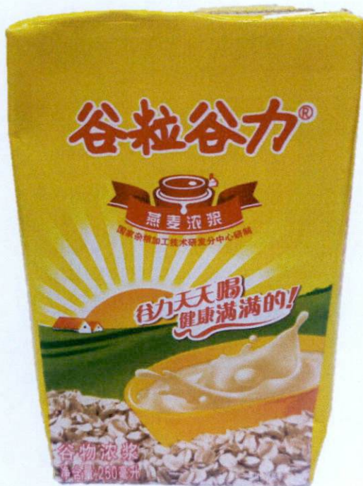
Figure 4. Unregistered Beverage in Yellow colored tetra pack with Oatmeal artwork (Labels are in foreign characters)