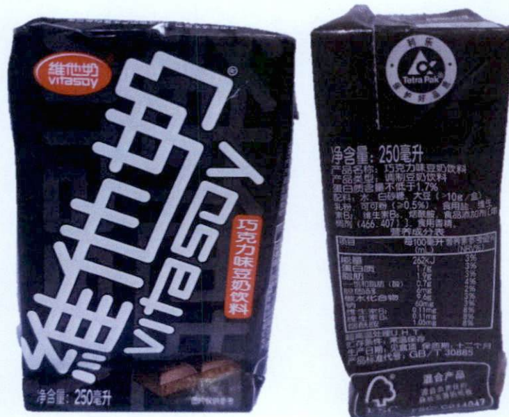
Figure 1. Unregistered VITASOY (in a Black and Red colored tetra pack with Chocolate artwork) (Labels are in foreign characters)

The Food and Drug Administration (FDA) warns all healthcare professionals and the general public NOT TO PURCHASE AND CONSUME the following unregistered food products: