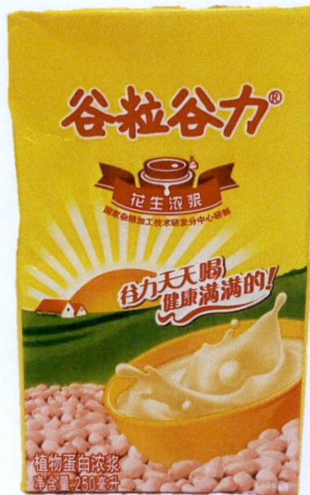
Figure 5. Unregistered Beverage in Yellow colored tetra pack with Soy artwork (Labels are in foreign characters)