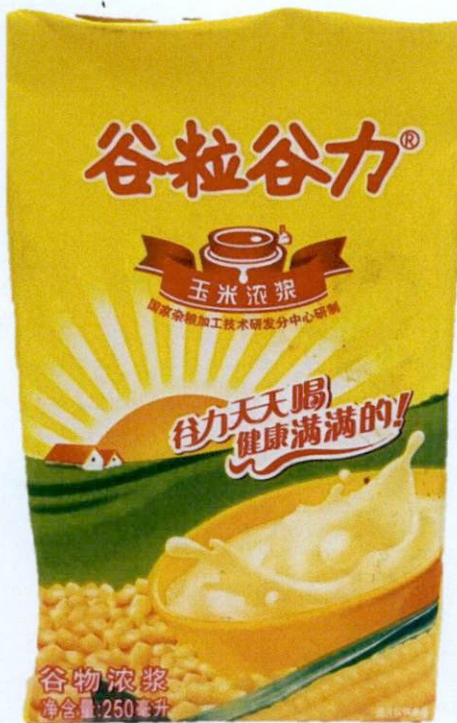
Figure 2. Unregistered Beverage in Yellow colored tetra pack with Corn artwork (Labels are in foreign characters)