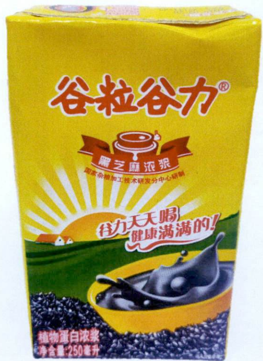
Figure 3. Unregistered Beverage in Yellow colored tetra pack with Black Rice artwork (Labels are in foreign characters)