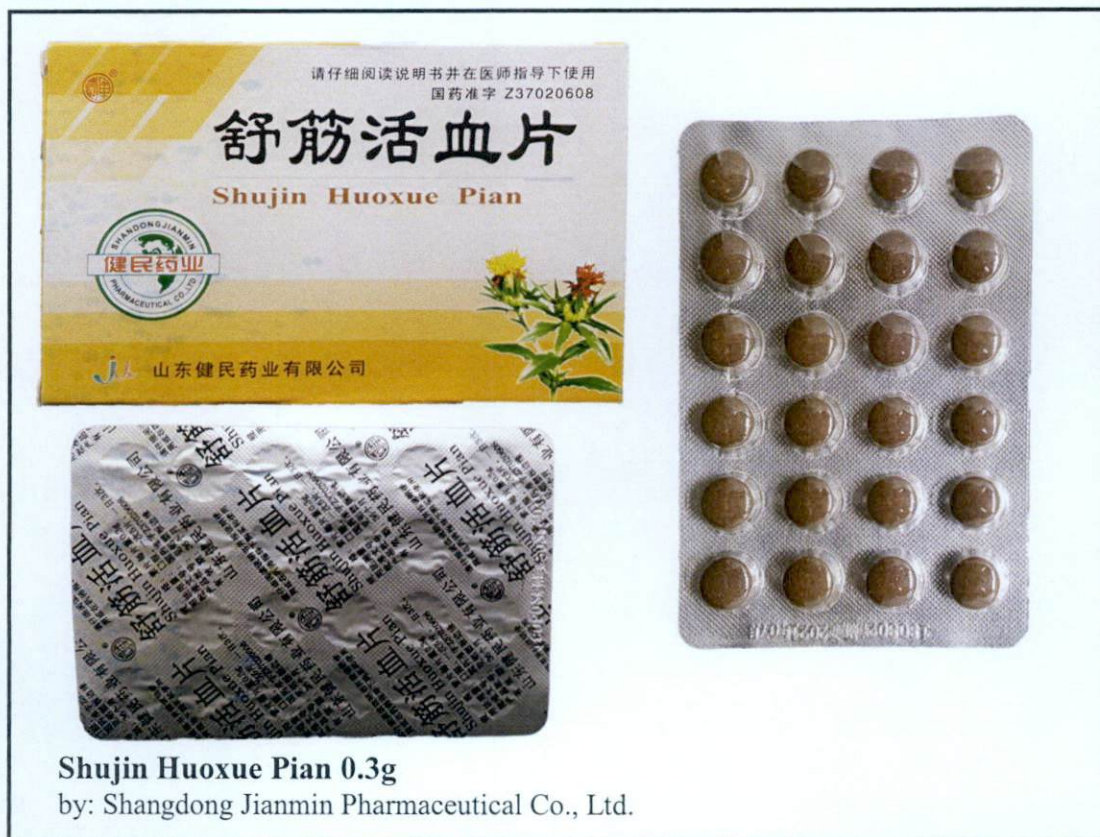
Shujin Huoxue Pian 0.3g by: Shangdong Jianmin Pharmaceutical Co., Ltd.

The Food and Drug Administration (FDA) advises the public against the purchase and use of the following unregistered drug products: