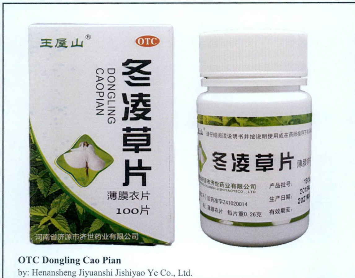
OTC Dongling Cao Pian