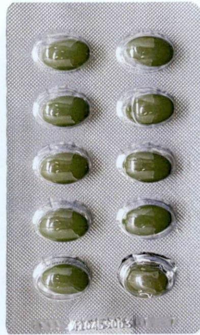
Baihekang Brand Aloe Vera Softgel 5g (500mg)