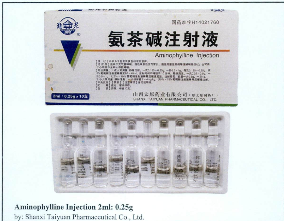
Aminophylline Injection 2ml: 0.25g