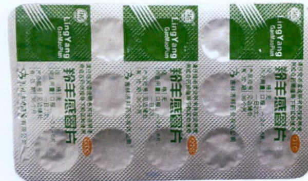
OTC Shuyao Ling Yang Ganmaopian