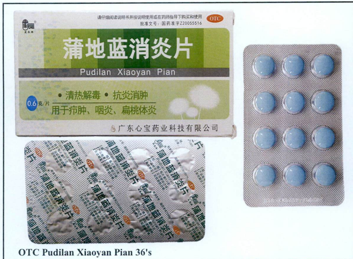
OTC Pudilan Xiaoyan Pian 36's