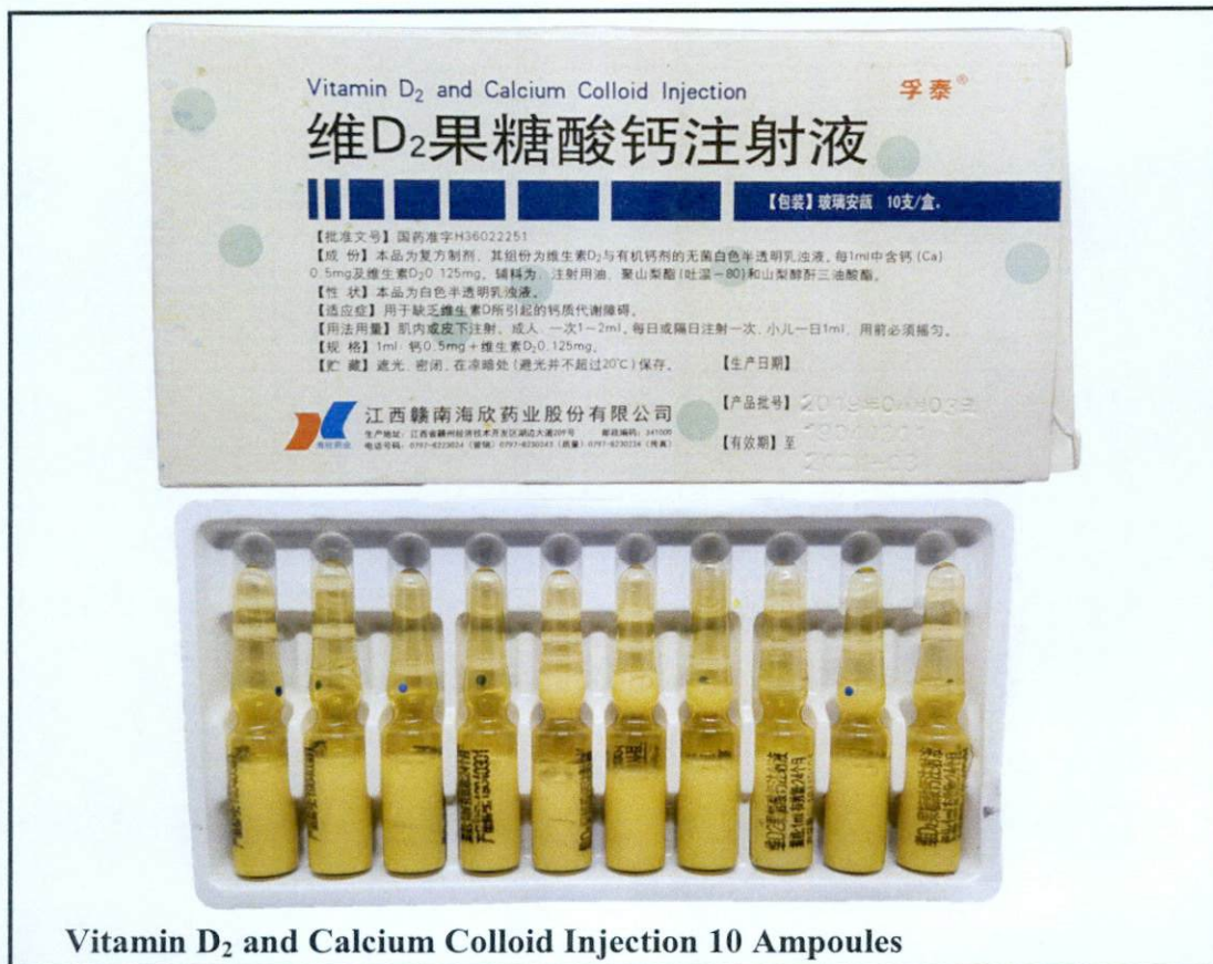
Vitamin D 2 and Calcium Colloid Injection 10 Ampoules

The Food and Drug Administration (FDA) advises the public against the purchase and use of the following unregistered drug products: