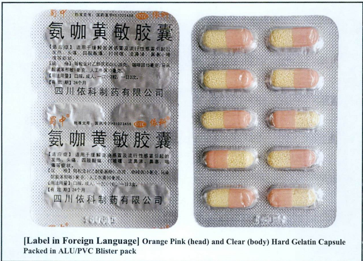
[Label in Foreign Language] Orange Pink (head) and Clear (body) Hard Gelatin Capsule Packed in ALU/PVC Blister pack