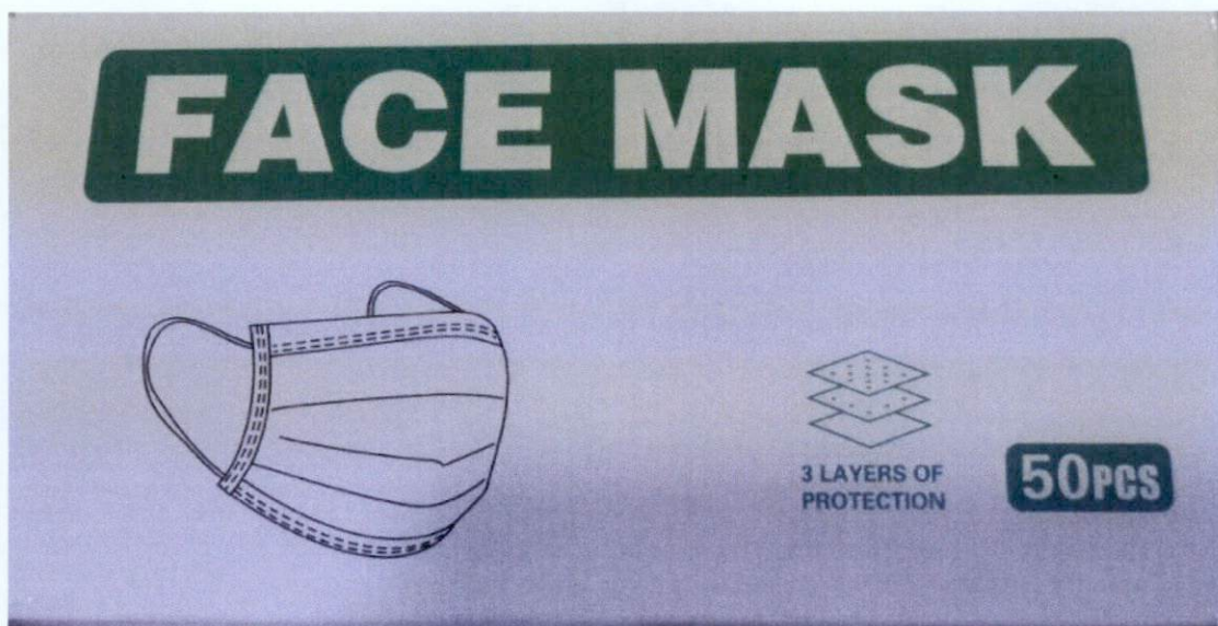
Figure 1. Unnotified Glitter® Face Mask