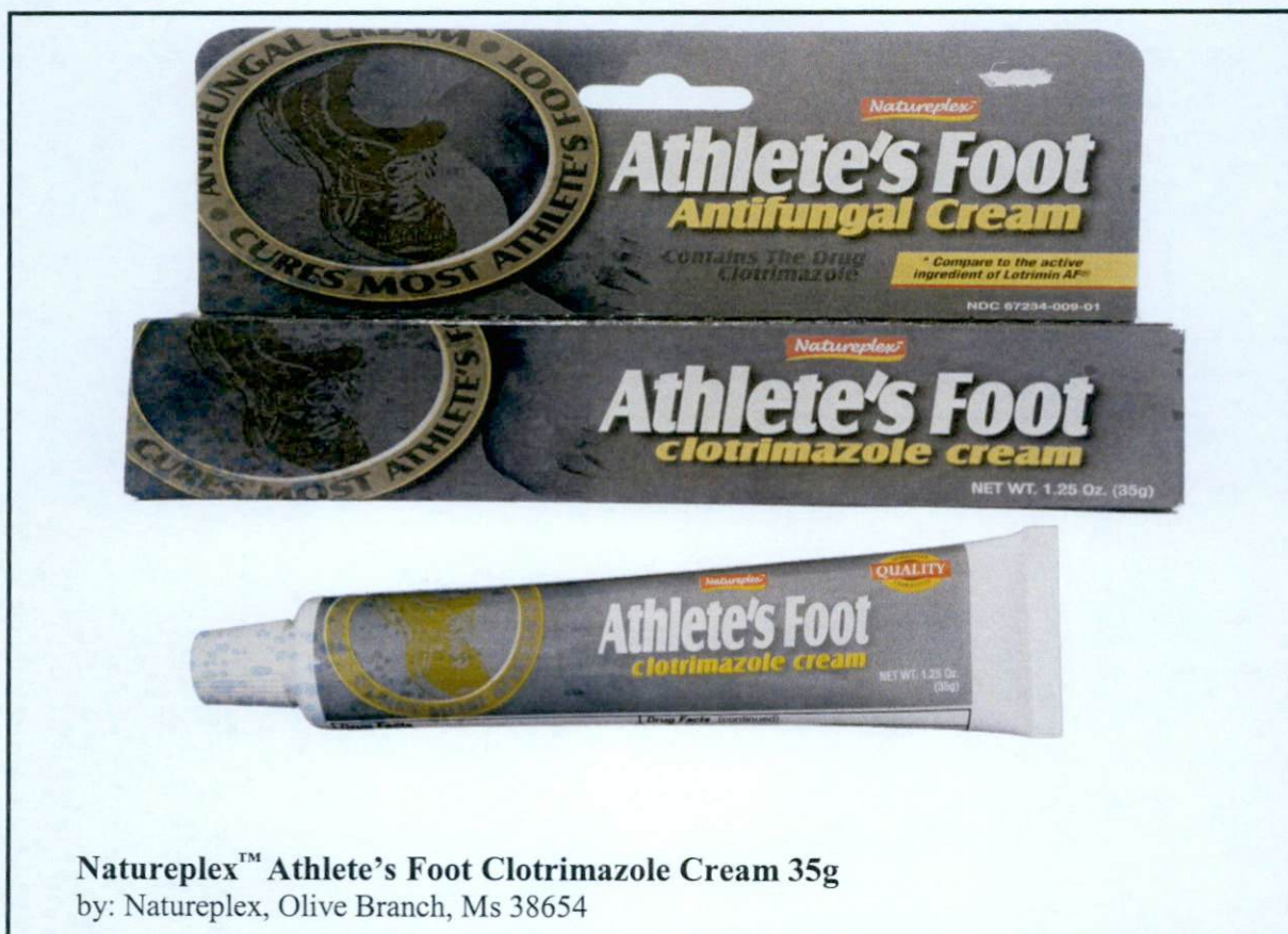
Natureplex™ Athlete's Foot Clotrimazole Cream 35g by: Natureplex, Olive Branch, Ms 38654