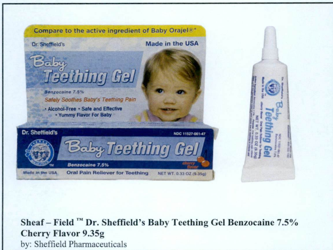
Sheaf – Field™ Dr. Sheffield's Baby Teething Gel Benzocaine 7.5% Cherry Flavor 9.35g by: Sheffield Pharmaceuticals

The Food and Drug Administration (FDA) advises the public against the purchase and use of the following unregistered drug products: