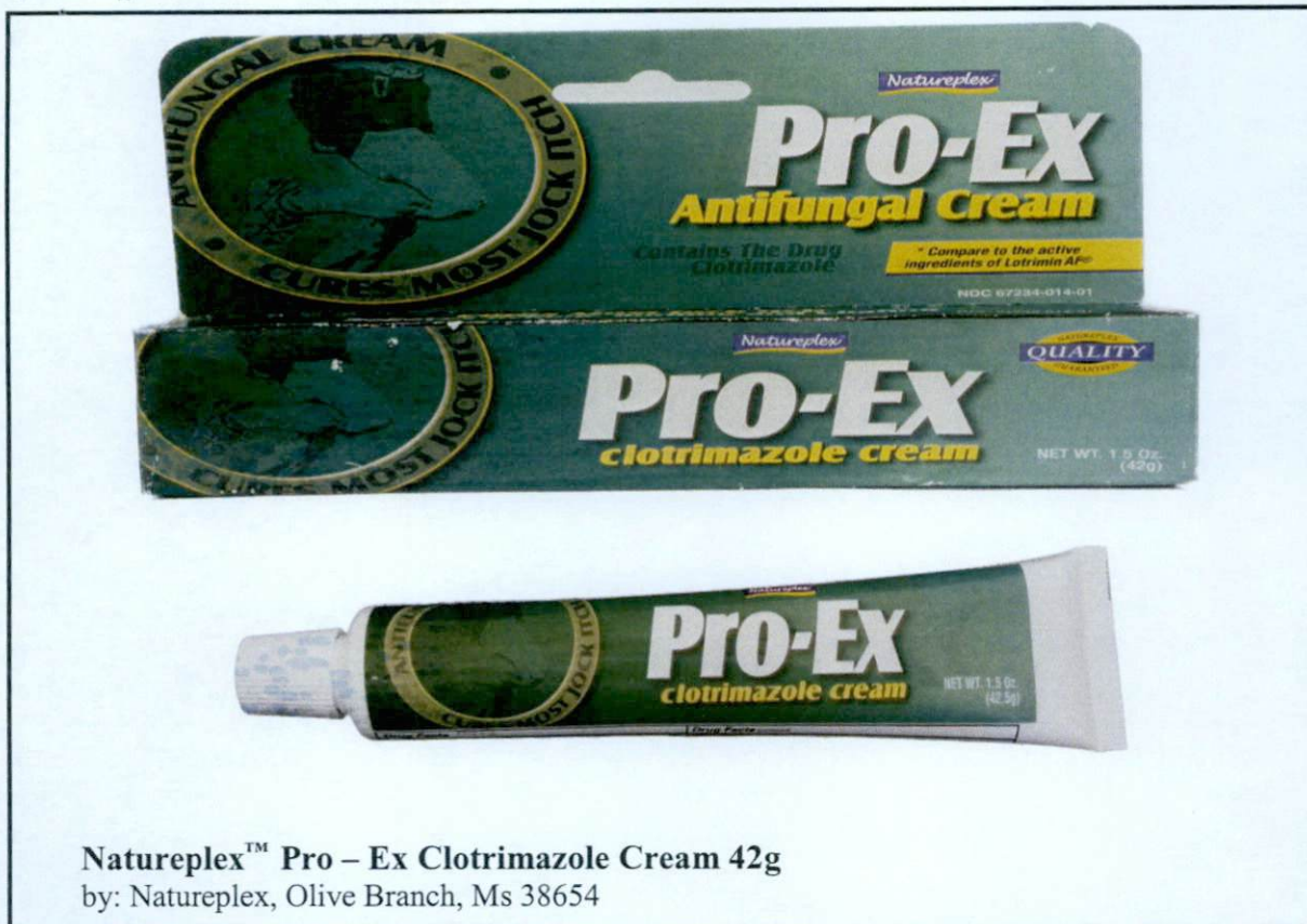
Natureplex™ Pro – Ex Clotrimazole Cream 42g by: Natureplex, Olive Branch, Ms 38654