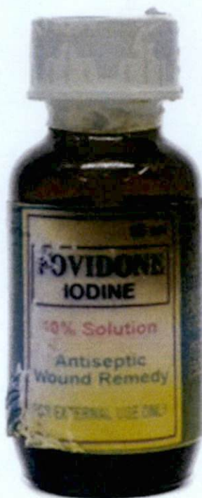
POVIDONE IODINE 10% Solution 15ml by: Neo-Era Industry – Malabon M.M.