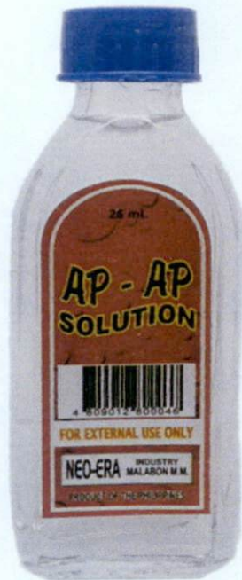
AP – AP Solution 25 mL by: Neo-Era Industry – Malabon M.M.