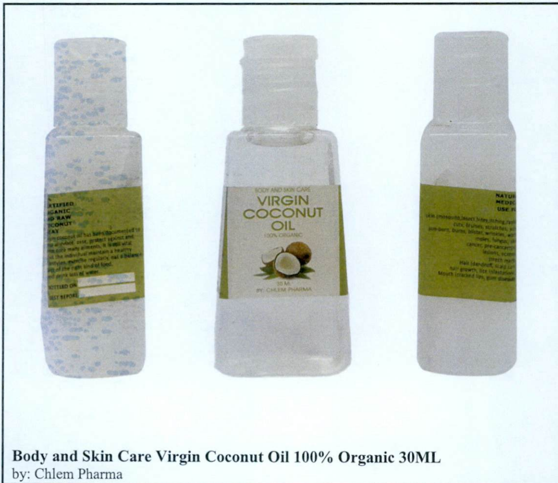
Body and Skin Care Virgin Coconut Oil 100% Organic 30ML by: Chlem Pharma

The Food and Drug Administration (FDA) advises the public against the purchase and use of the unregistered drug product: