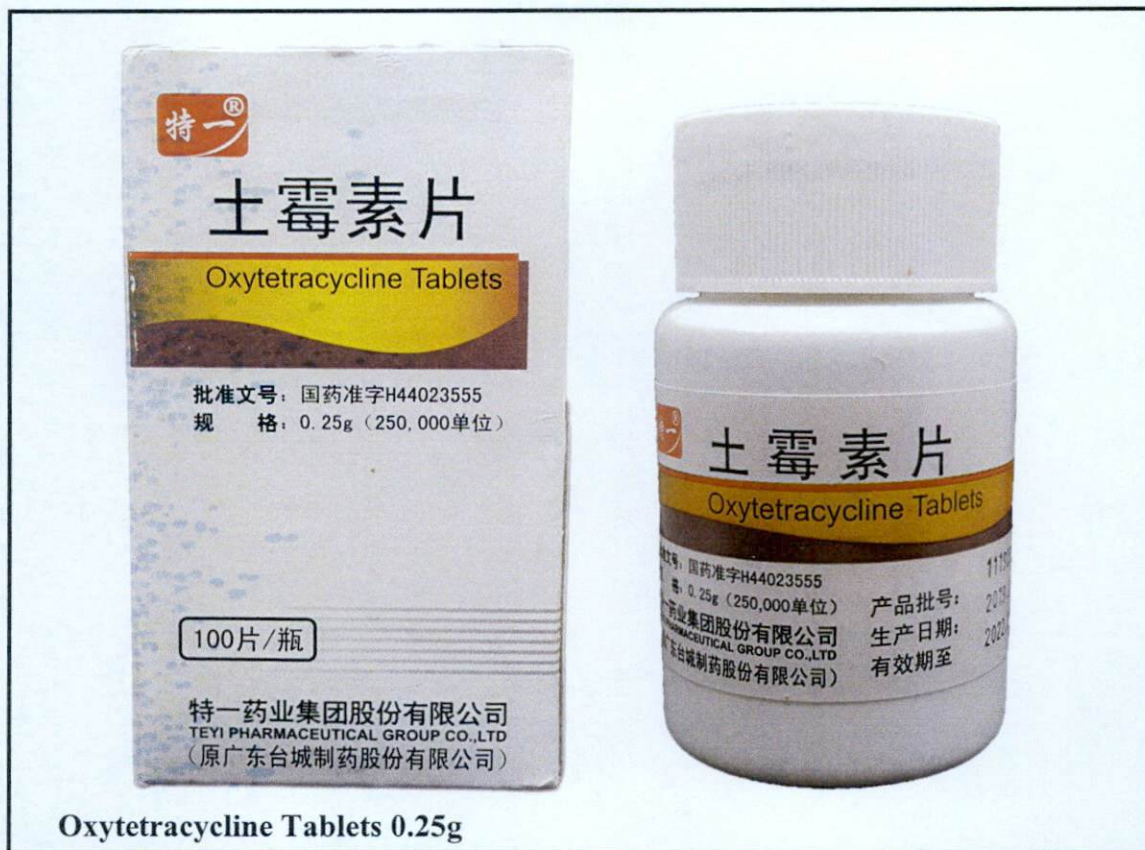
Figure 4. Unregistered drug product

FDA Post-Marketing Surveillance (PMS) activities have verified that the abovementioned drug products have not gone through the registration process of the Agency and have not been issued with proper authorization in the form of Certificate of Product Registration. Thus, the Agency cannot guarantee its quality, safety and efficacy. Therefore, consumption of such violative products may pose potential danger or injury to health.