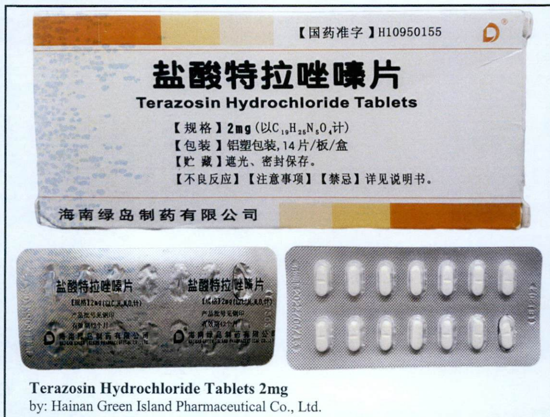
Figure 1. Unregistered drug product

The Food and Drug Administration (FDA) advises the public against the purchase and use of the following unregistered drug products: