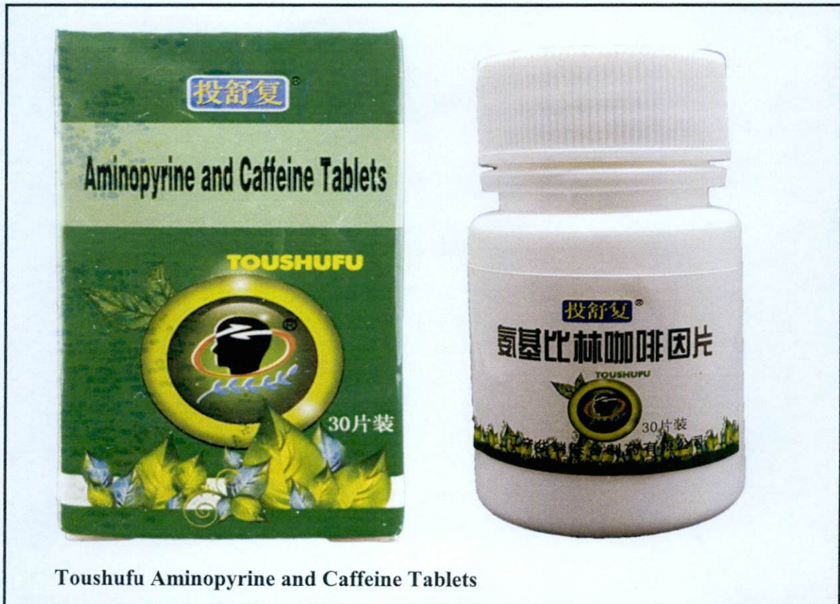
Figure 3. Unregistered drug product