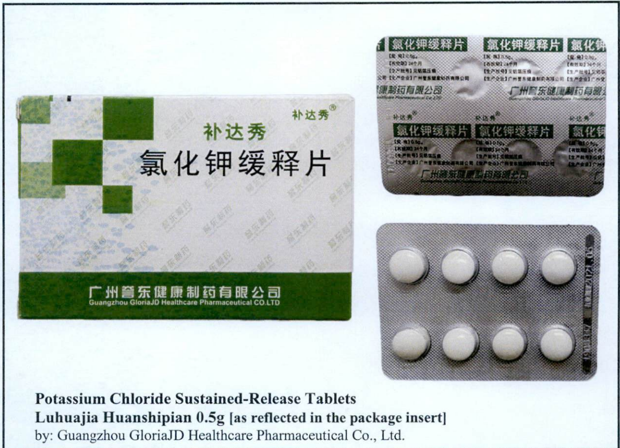
Figure 2. Unregistered drug product