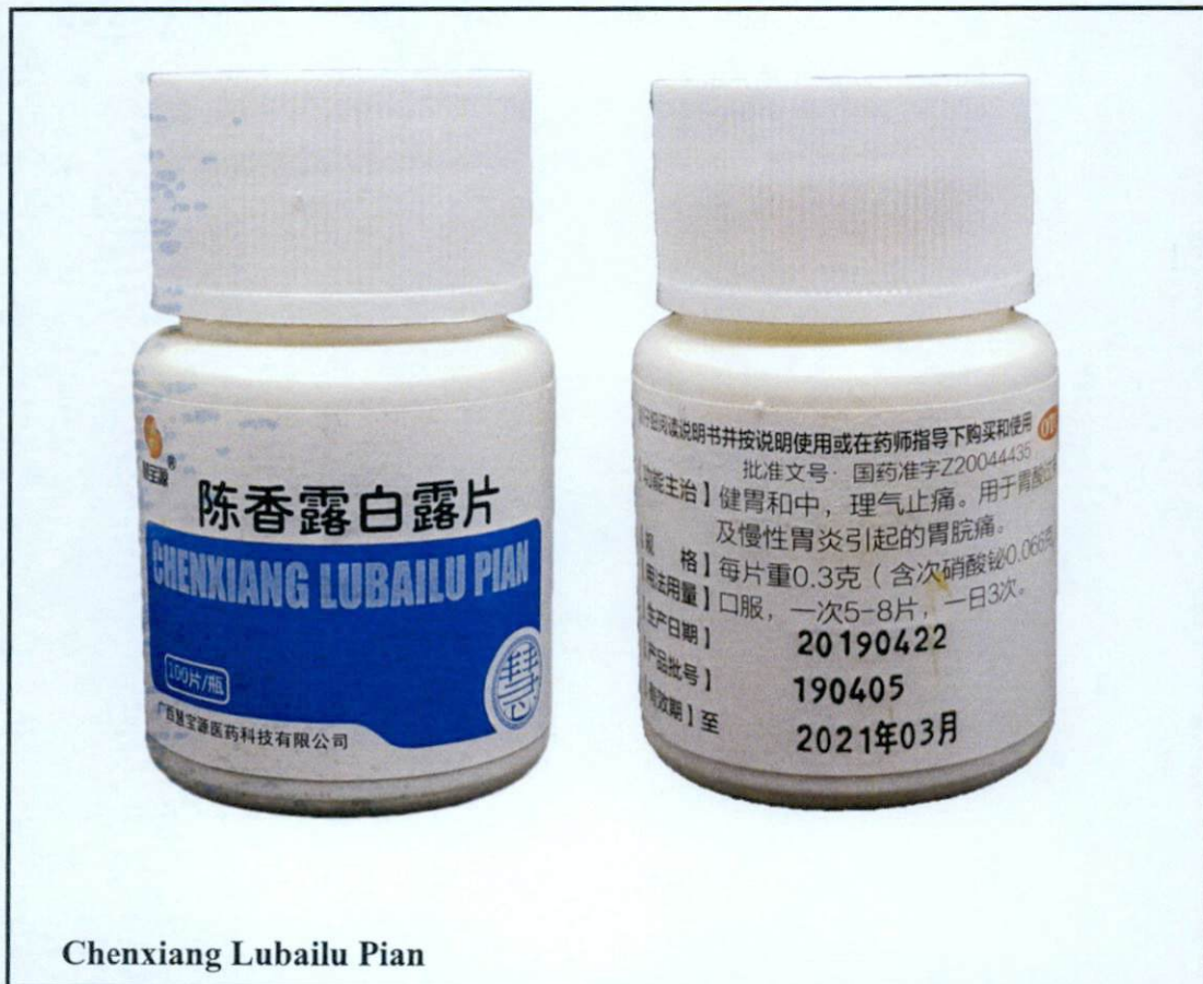
Chenxiang Lubailu Pian

The Food and Drug Administration (FDA) advises the public against the purchase and use of the following unregistered drug products: