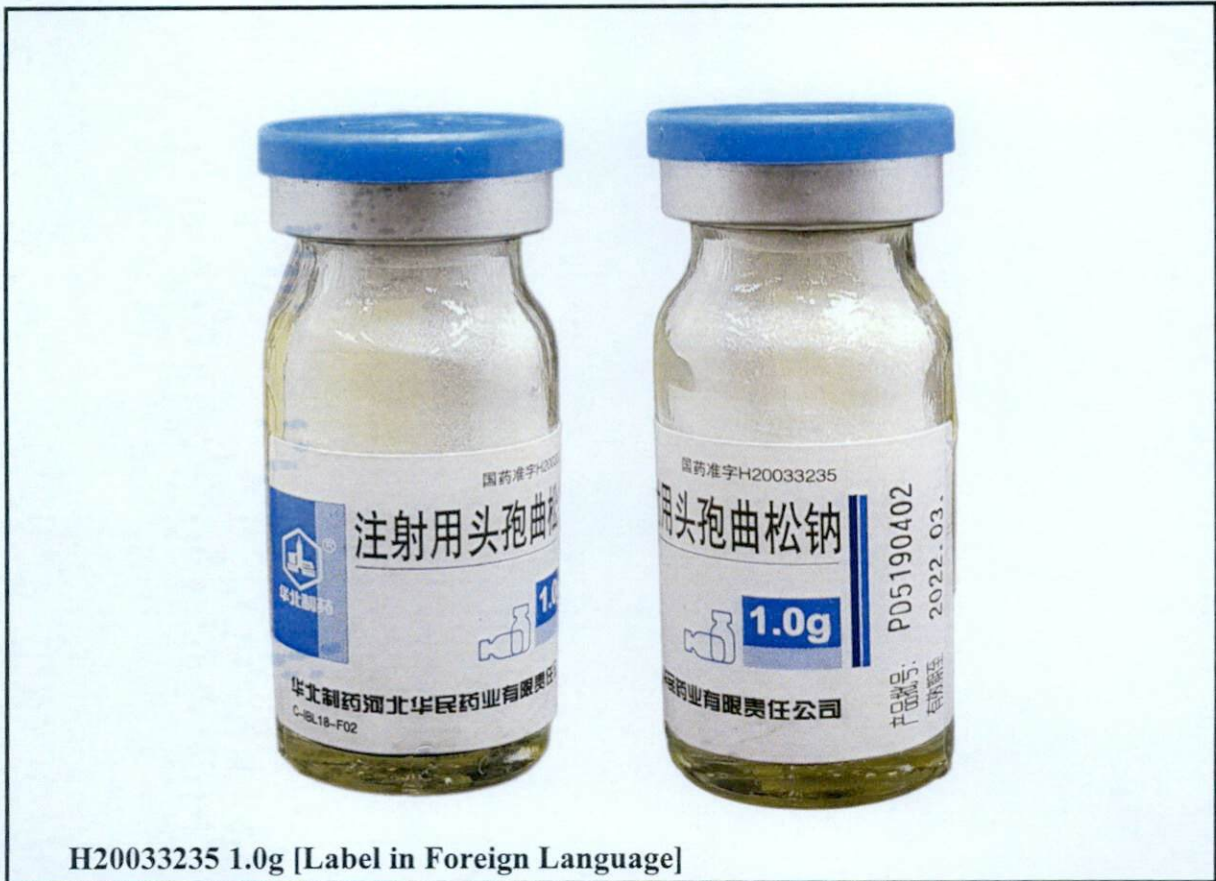
H20033235 1.0g [Label in Foreign Language]