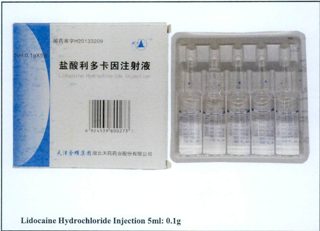
Lidocaine Hydrochloride Injection 5ml: 0.1g