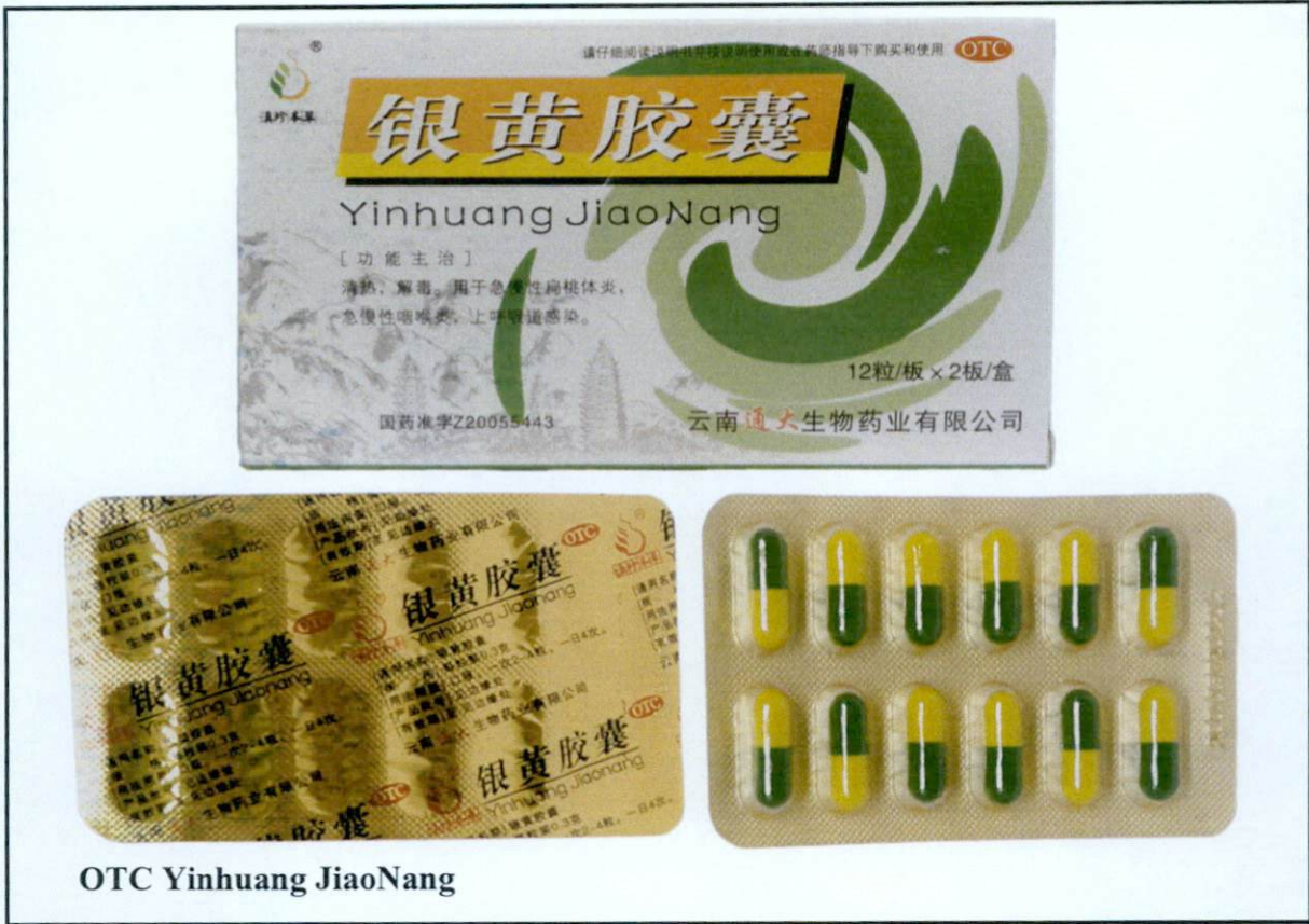
OTC Yinhuang JiaoNang