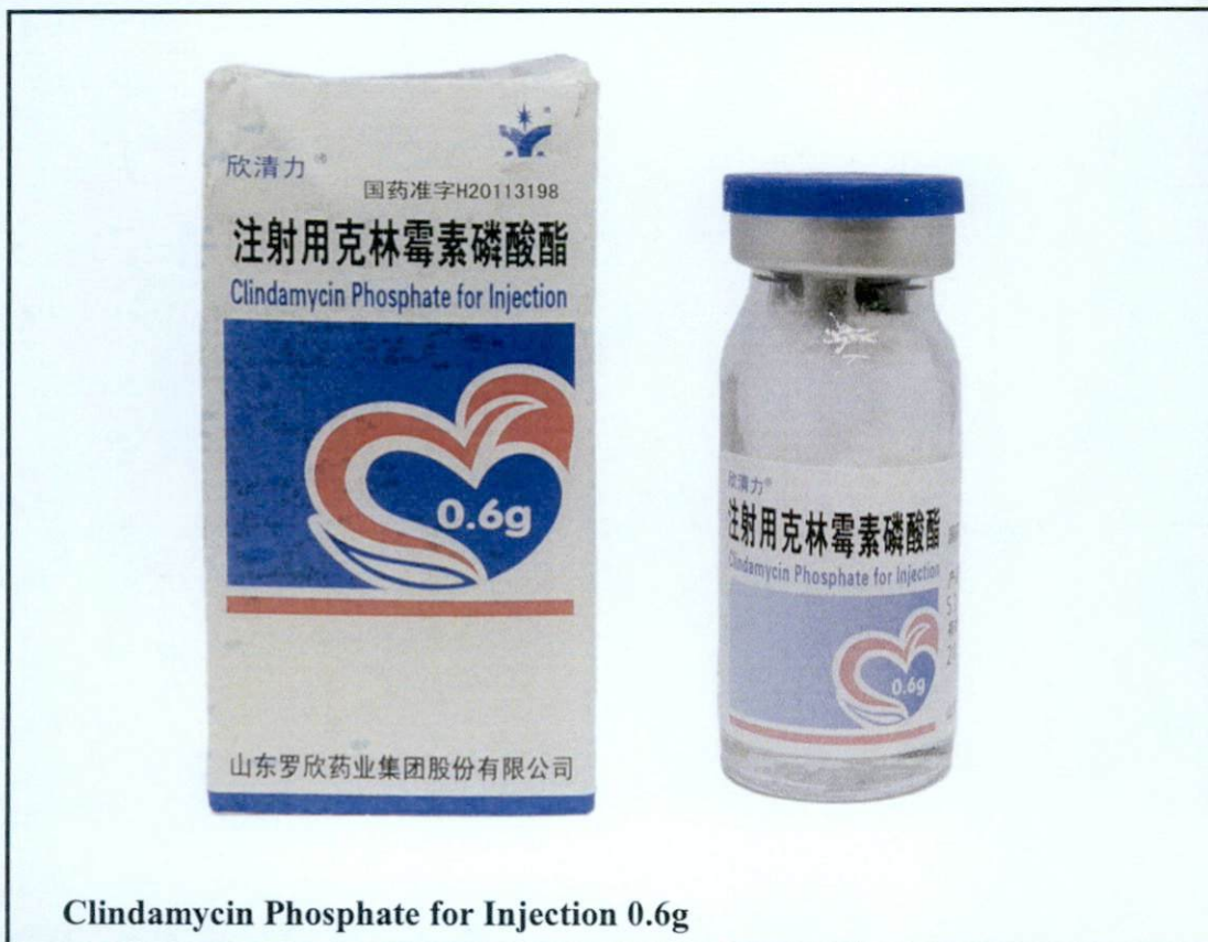
Clindamycin Phosphate for Injection 0.6g

The Food and Drug Administration (FDA) advises the public against the purchase and use of the following unregistered drug products: