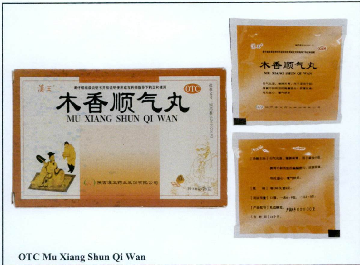
OTC Mu Xiang Shun Qi Wan