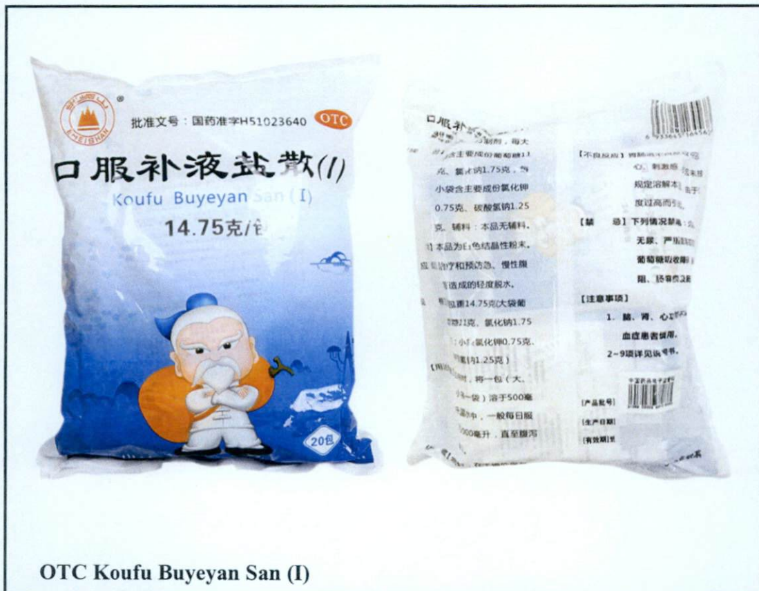
OTC Koufu Buyeyan San (I)

The Food and Drug Administration (FDA) advises the public against the purchase and use of the following unregistered drug products: