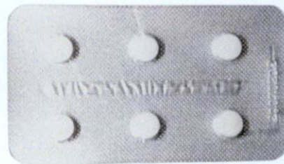
OTC Bye Allergy Loratadine Tablets