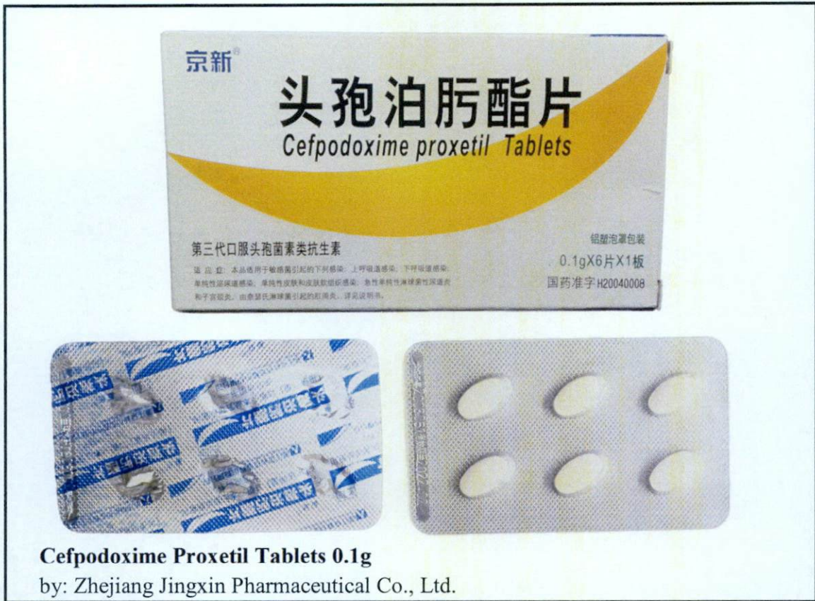
Cefpodoxime Proxetil Tablets 0.1g by: Zhejiang Jingxin Pharmaceutical Co., Ltd.