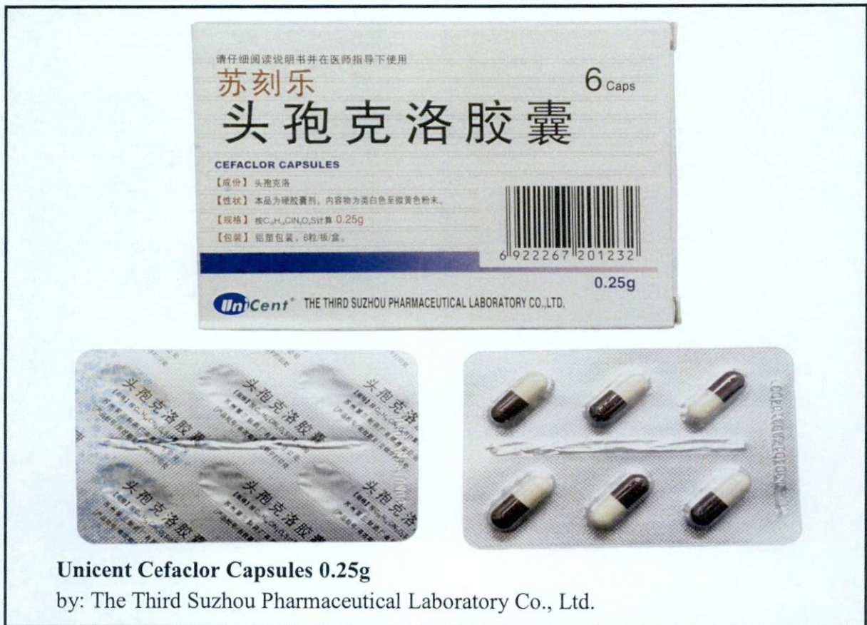
UniCent Cefaclor Capsules 0.25g