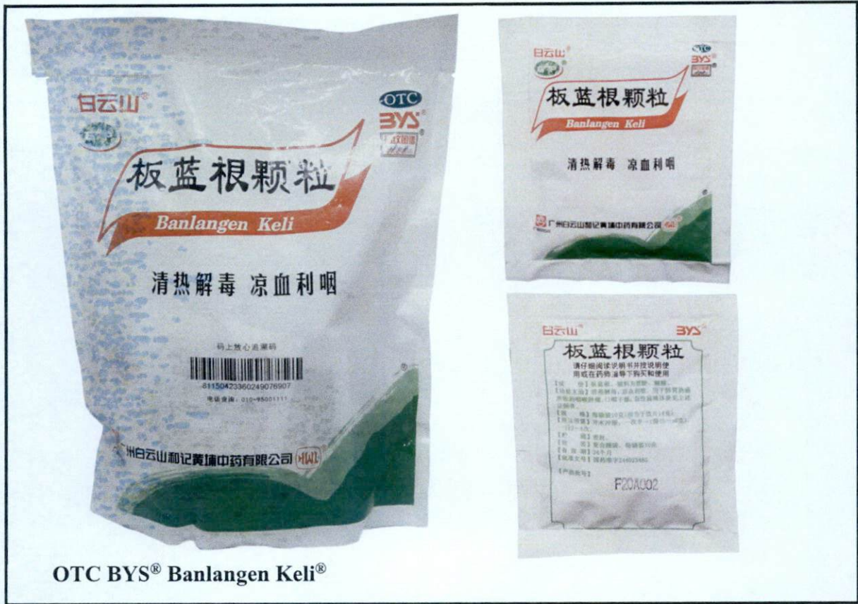
OTC BYS® Banlangen Keli®