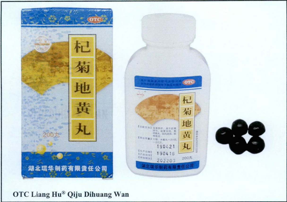
OTC Liang Hu® Qiju Dihuang Wan