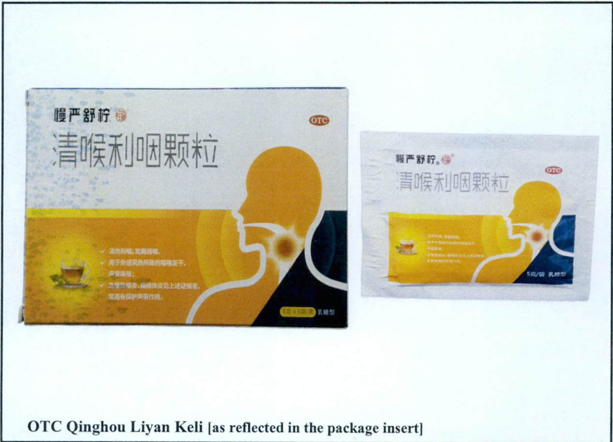
OTC Qinghou Liyan Keli [as reflected in the package insert]