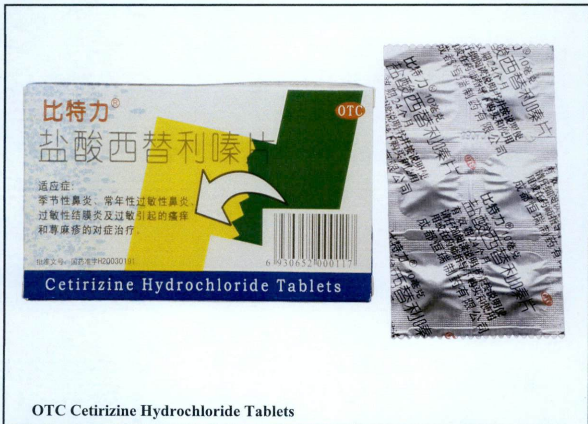
OTC Cetirizine Hydrochloride Tablets

The Food and Drug Administration (FDA) advises the public against the purchase and use of the following unregistered drug products: