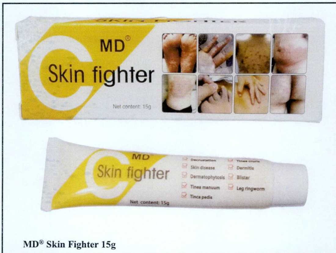
MD® Skin Fighter 15g

The Food and Drug Administration (FDA) advises the public against the purchase and use of the following unregistered drug products: