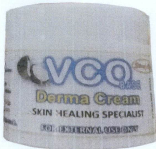
VCO Base Derma Cream Skin Healing Specialist Distributed by: Wellness and Beauty Products