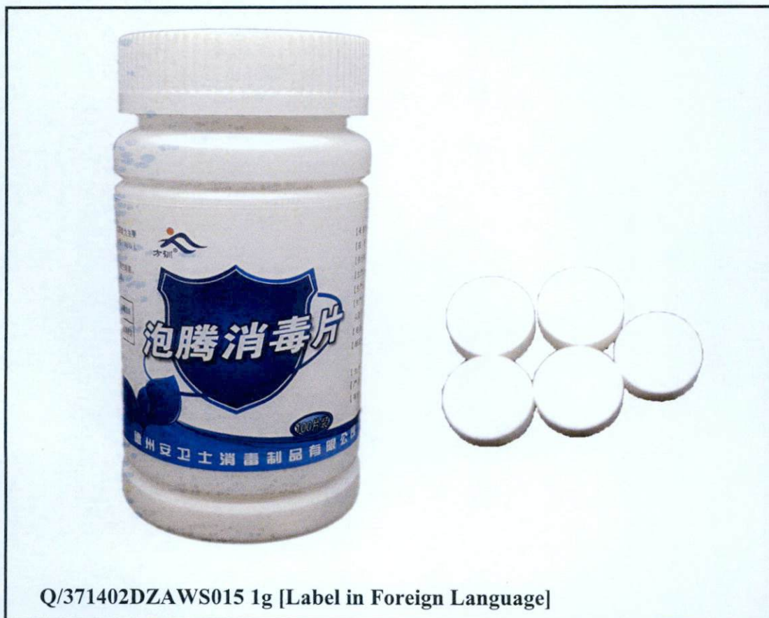
Q/371402DZAWS015 1g [Label in Foreign Language]

The Food and Drug Administration (FDA) advises the public against the purchase and use of the following unregistered drug products: