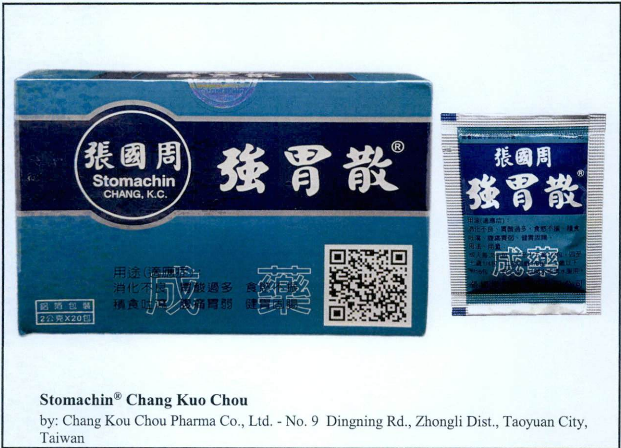
Figure 2. Unregistered drug product

by: Sichuan Zhongfang Zhiyao Youxian Gongsi