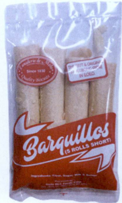
Figure 3. Unregistered PANADERIA DE MOLO Barquillos