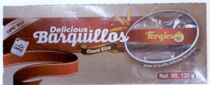
Figure 5. Unregistered FERGIE'S Delicious Barquillos Giant Size