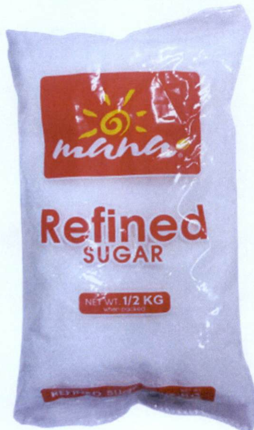
Figure 1. Unregistered MANA Refined Sugar

The Food and Drug Administration (FDA) warns all healthcare professionals and the general public NOT TO PURCHASE AND CONSUME the following unregistered food products: