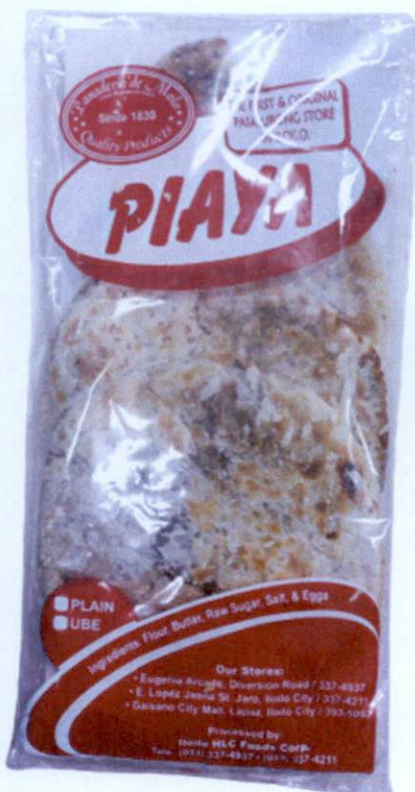
Figure 4. Unregistered PANADERIA DE MOLO Piaya