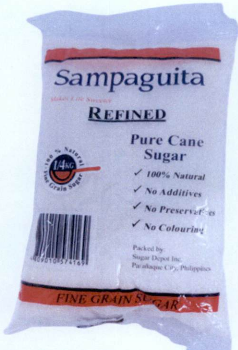
Figure 2. Unregistered SAMPAGUITA Refined Pure Cane Sugar