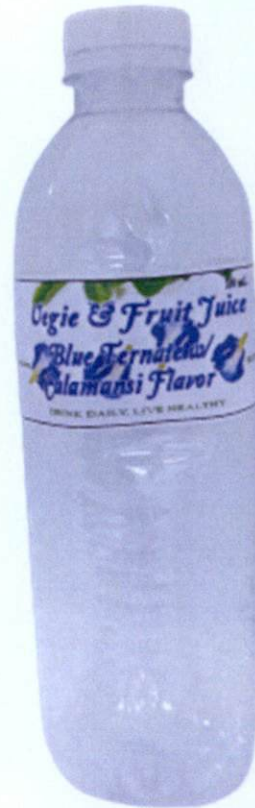
Figure 3. Unregistered VEGIE & FRUIT JUICE Blue Ternate with Calamansi