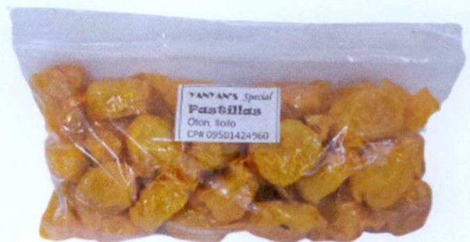
Figure 5. Unregistered YANYAN'S Special Pastillas