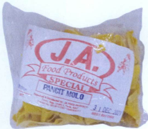
Figure 4. Unregistered J.A. Special Pancit Molo