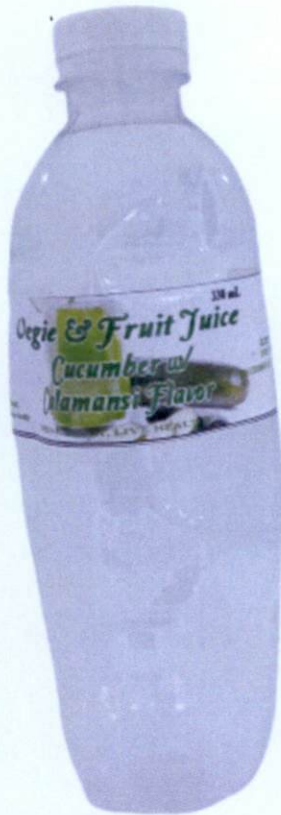
Figure 2. Unregistered VEGIE & FRUIT JUICE Cucumber with Calamansi