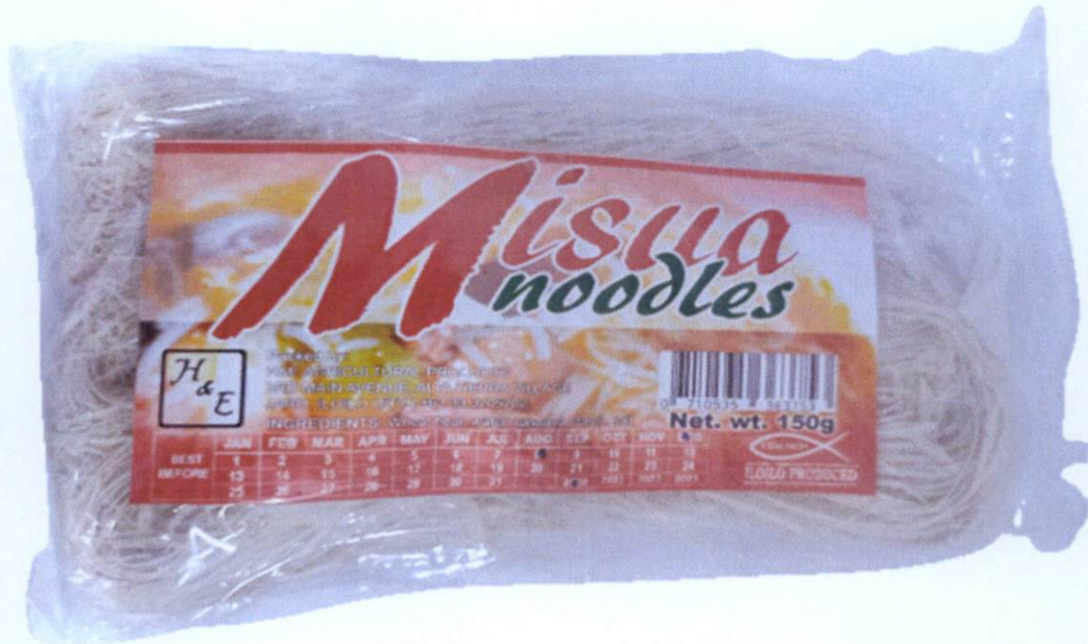
Figure 1. Unregistered MISUA Noodles

The Food and Drug Administration (FDA) warns all healthcare professionals and the general public NOT TO PURCHASE AND CONSUME the following unregistered food products: