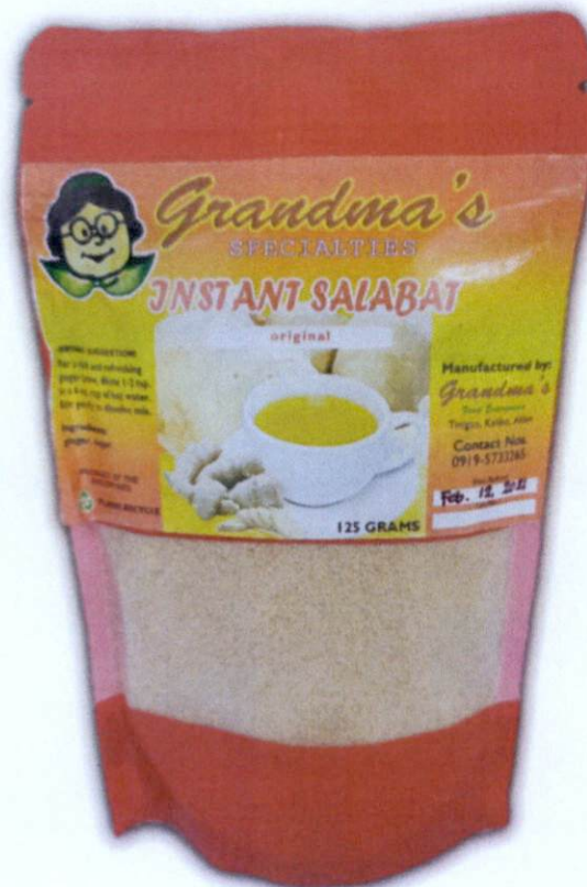
Figure 1. Unregistered GRANDMA'S SPECIALTIES Instant

The Food and Drug Administration (FDA) warns all healthcare professionals and the general public NOT TO PURCHASE AND CONSUME the following unregistered food products: