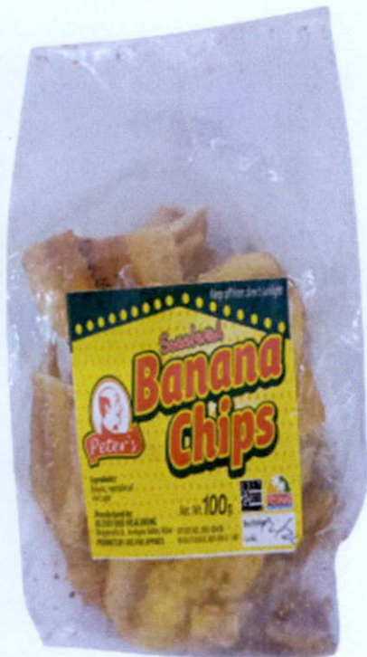
Figure 4. Unregistered PETER'S Sweetened Banana Chips