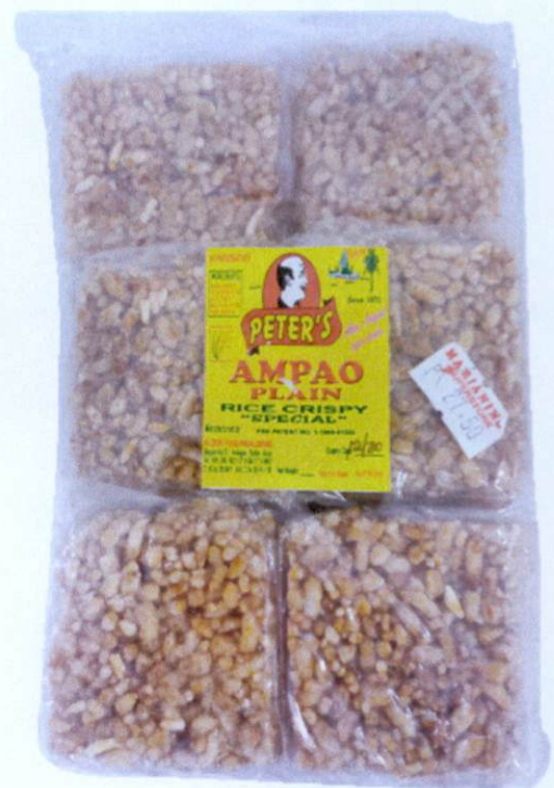
Figure 5. Unregistered PETER'S Special Ampao Plain Rice Crispy