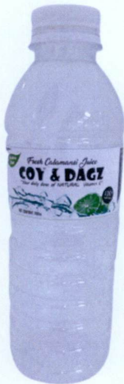
Figure 2. Unregistered COY & DAGZ Fresh Calamansi Juice