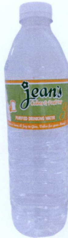
Figure 3. Unregistered JEAN'S Purified Drinking Water