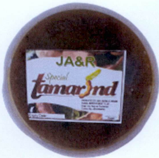
Figure 2. Unregistered JA&R Special Tamarind