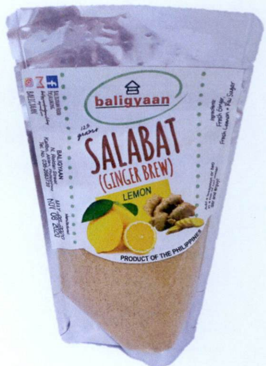
Figure 5. Unregistered BALIGYAAN Salabat (Ginger Brew) Lemon