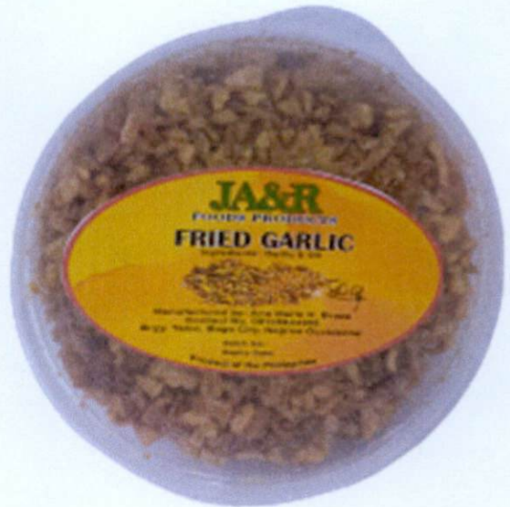
Figure 3. Unregistered JA&R FOOD PRODUCTS Fried Garlic