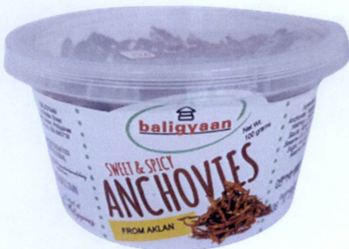
Figure 4. Unregistered BALIGYAAN Sweet & Spicy Anchovies