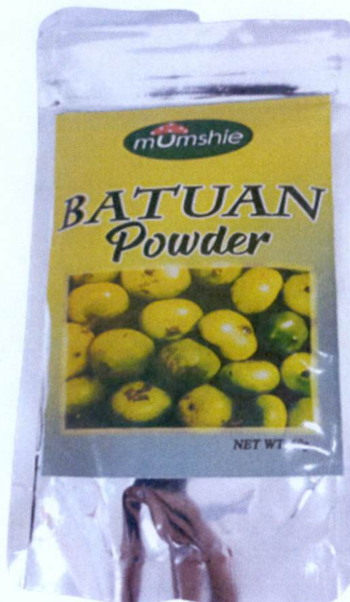
Figure 1. Unregistered MUMSHIE Batuan Powder

The Food and Drug Administration (FDA) warns all healthcare professionals and the general public NOT TO PURCHASE AND CONSUME the following unregistered food products: