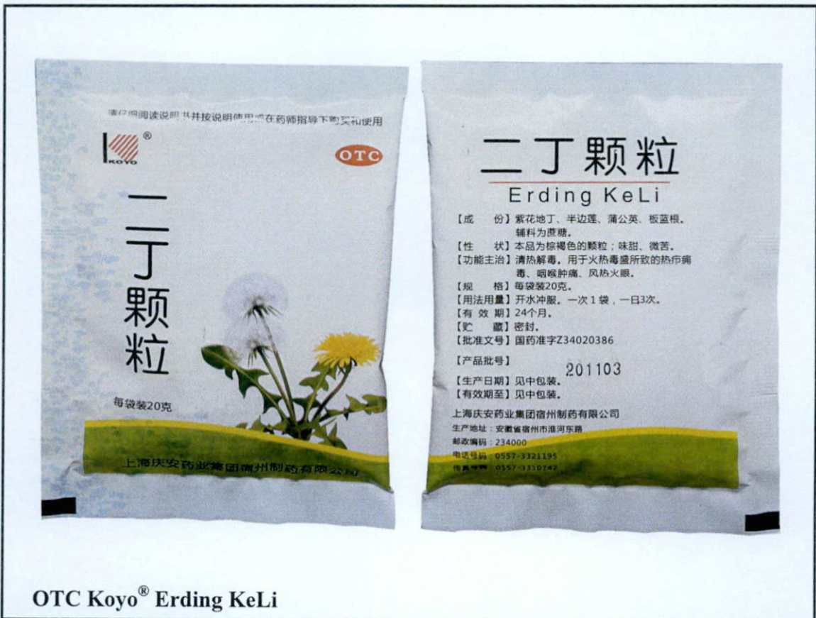
Figure 5. Unregistered drug product