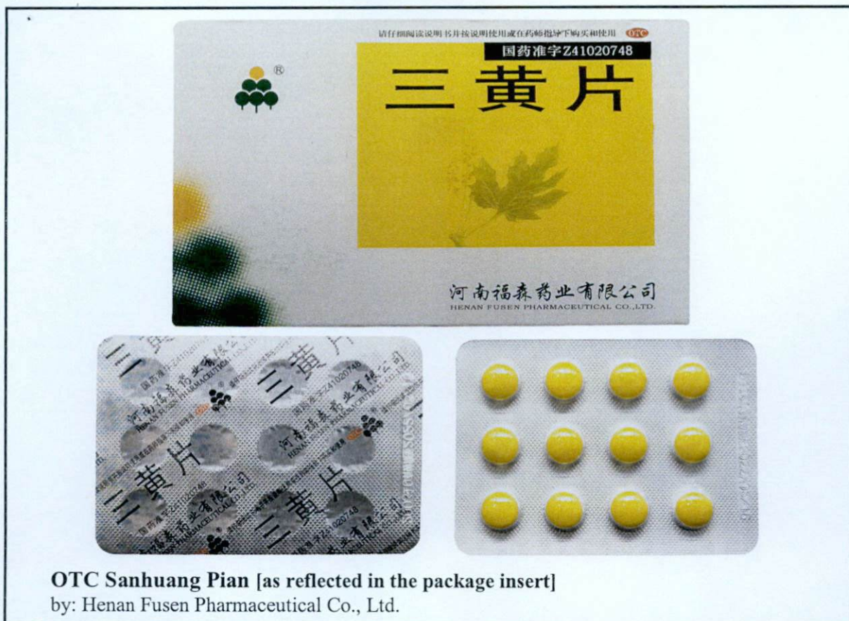
Figure 2. Unregistered drug product