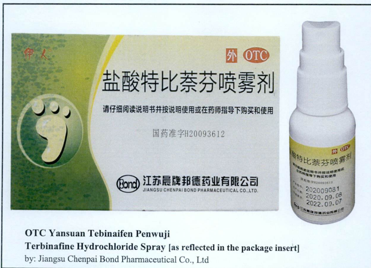
Figure 3. Unregistered drug product