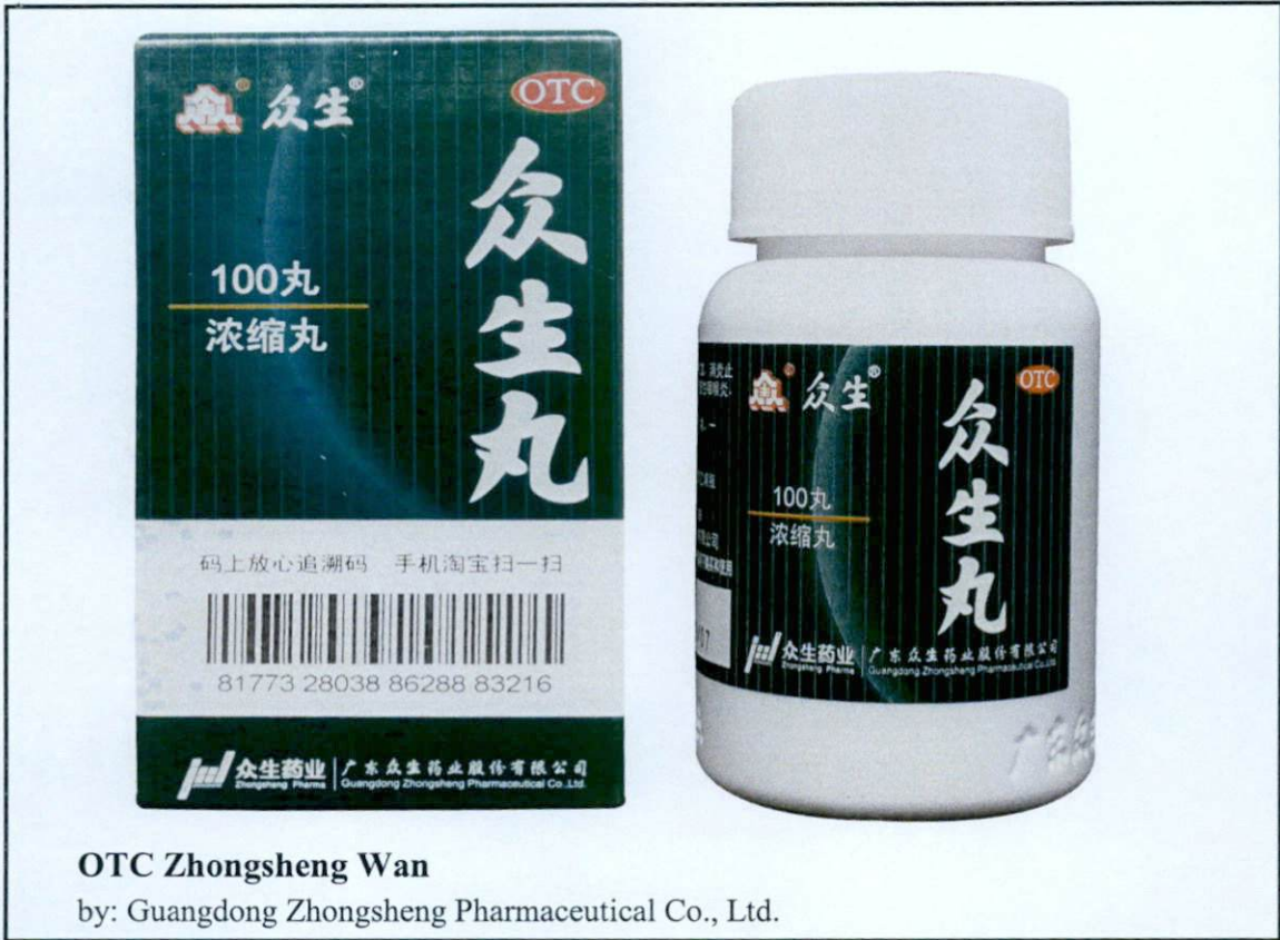
Figure 4. Unregistered drug product