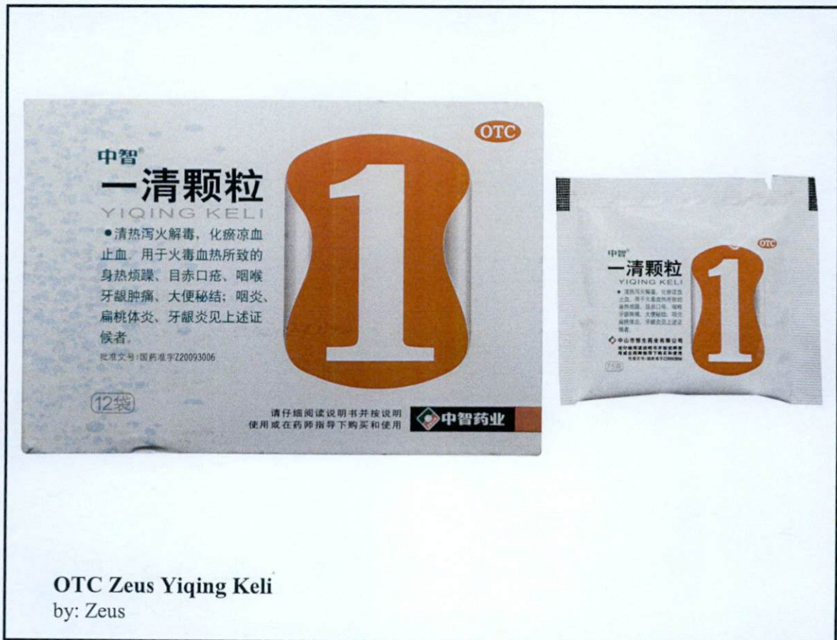
Figure 1. Unregistered drug product

The Food and Drug Administration (FDA) advises the public against the purchase and use of the following unregistered drug products: