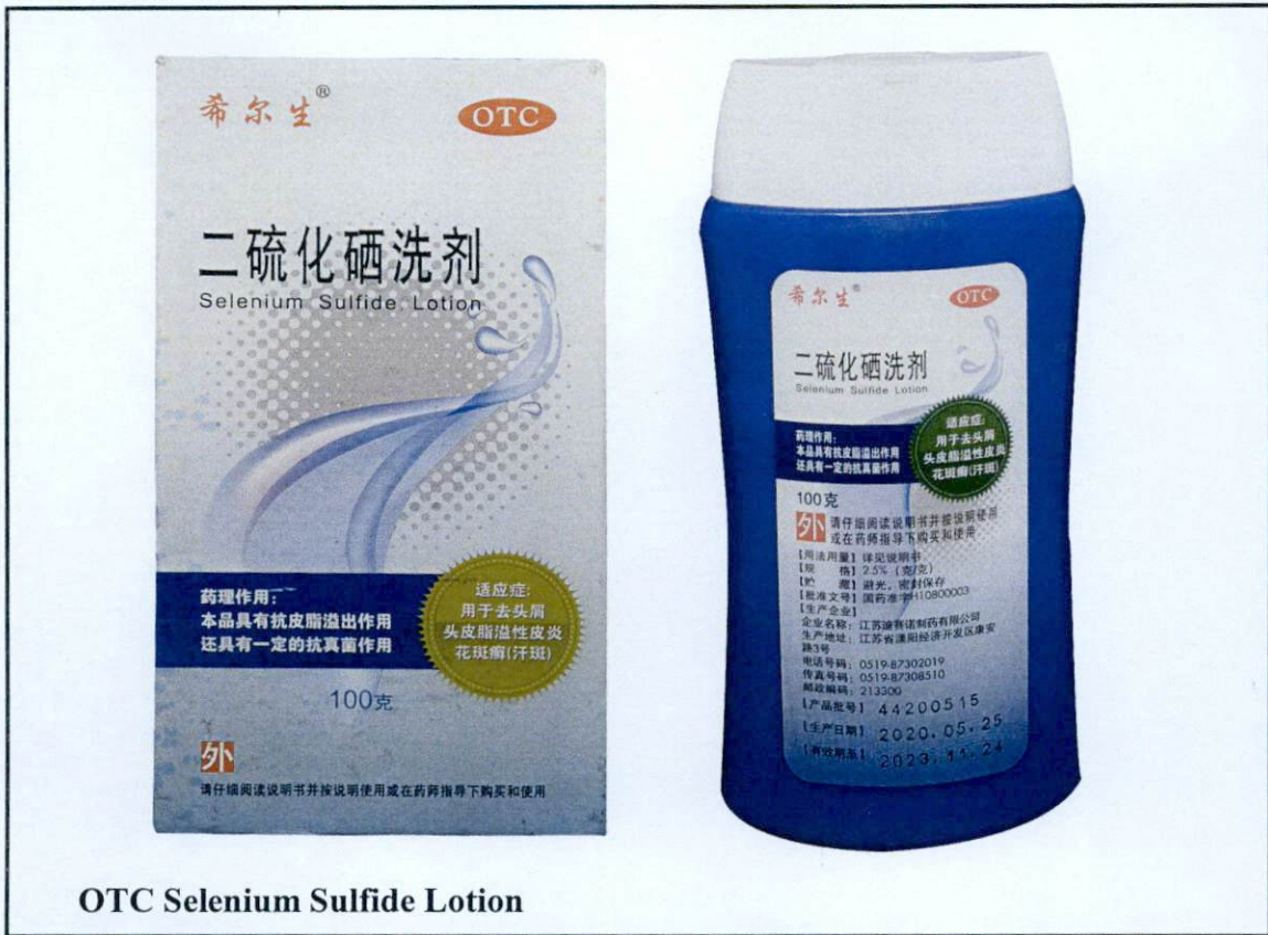
OTC Selenium Sulfide Lotion