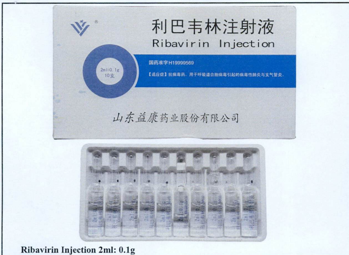
Ribavirin Injection 2ml: 0.1g