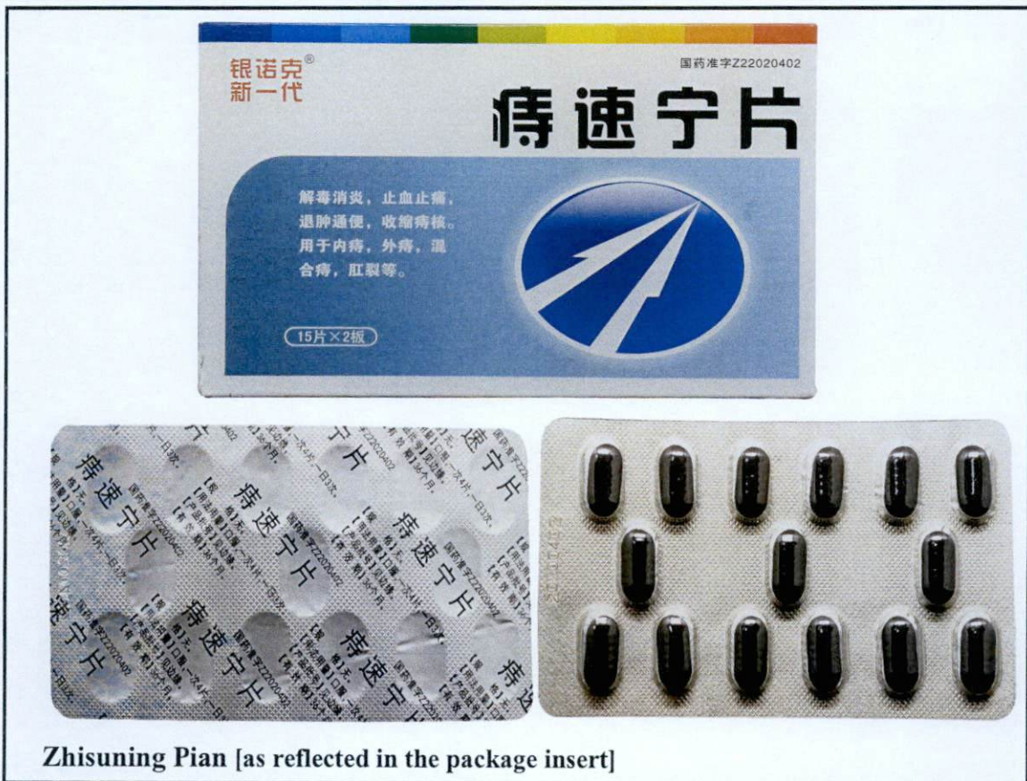
Zhisuning Pian [as reflected in the package insert]