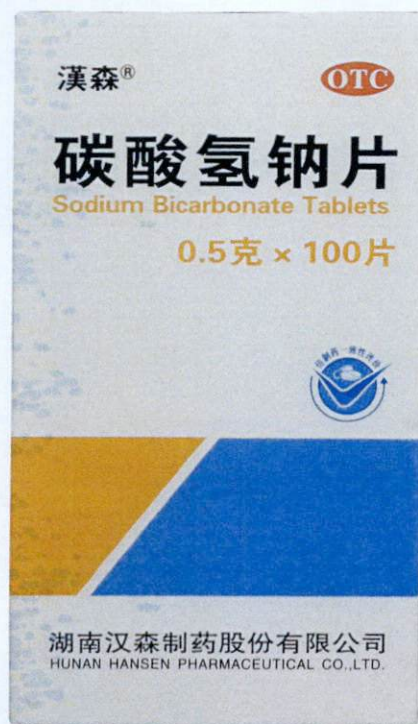
Figure 2. Unregistered drug product

by: Changchun People Pharmaceutical Group Co., Ltd.