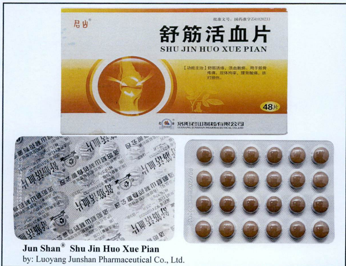
Jun Shan ® Shu Jin Huo Xue Pian by: Luoyang Junshan Pharmaceutical Co., Ltd.

The Food and Drug Administration (FDA) advises the public against the purchase and use of the following unregistered drug products: