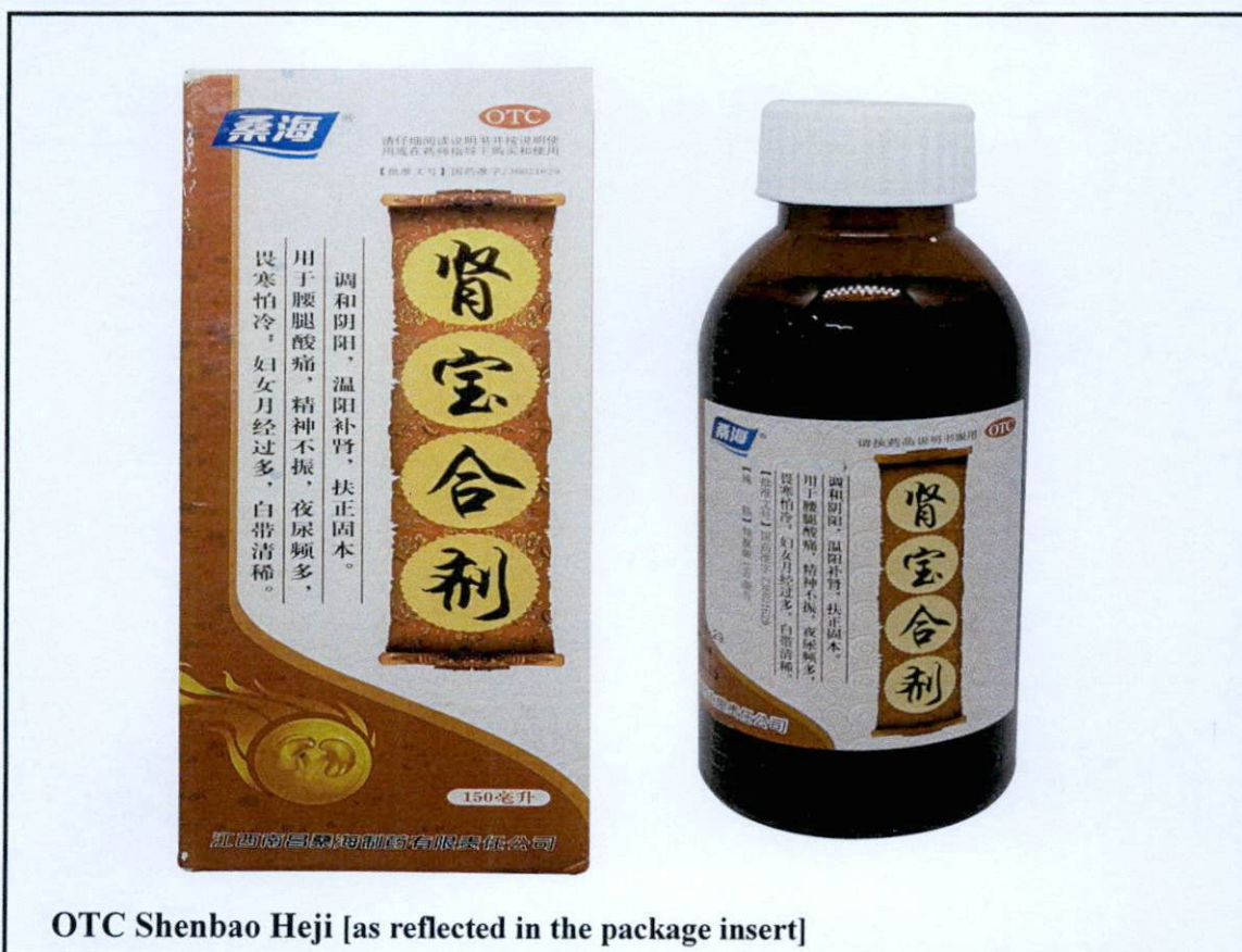
OTC Shenbao Heji [as reflected in the package insert]