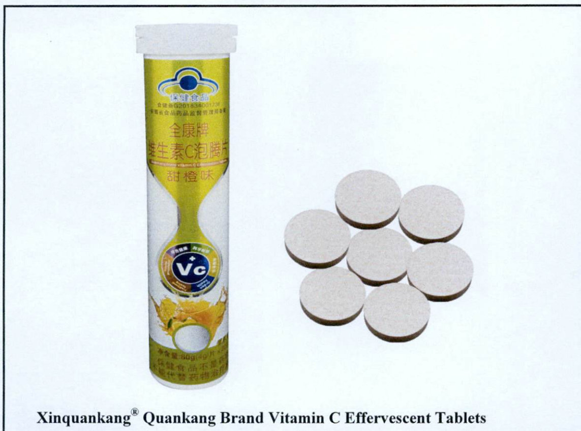
Xinquankang® Quankang Brand Vitamin C Effervescent Tablets