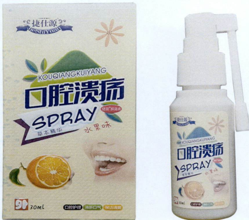
JieShiYuan® Kouquiangkuiyang Spray 30ml