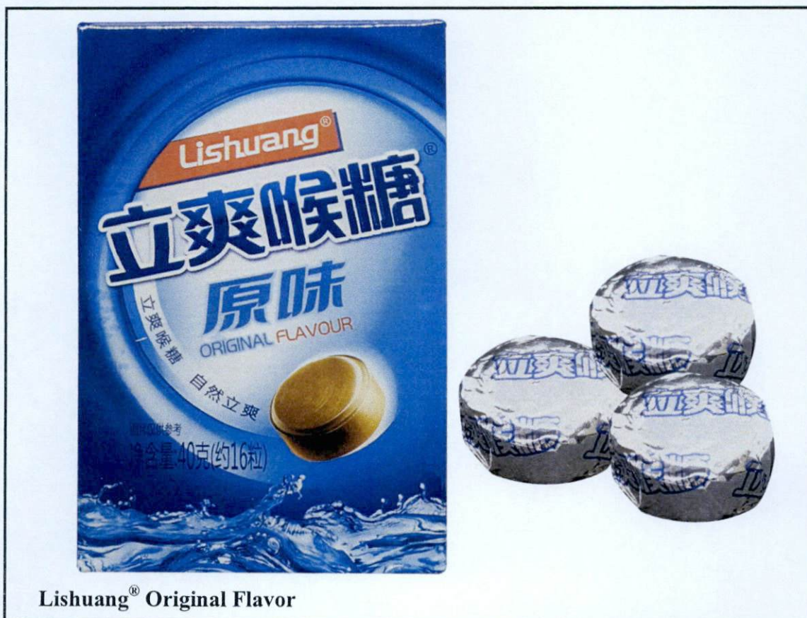
Figure 5. Unregistered drug product