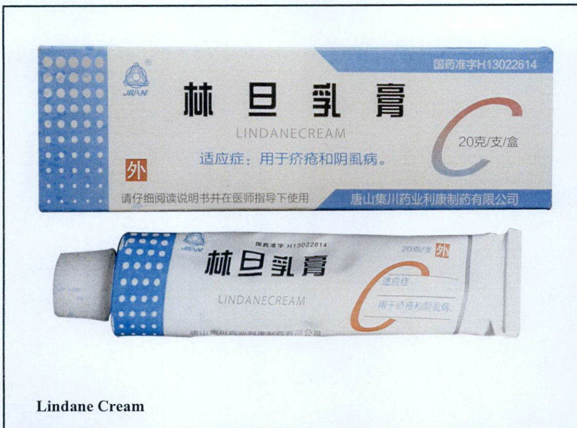
Figure 4. Unregistered drug product