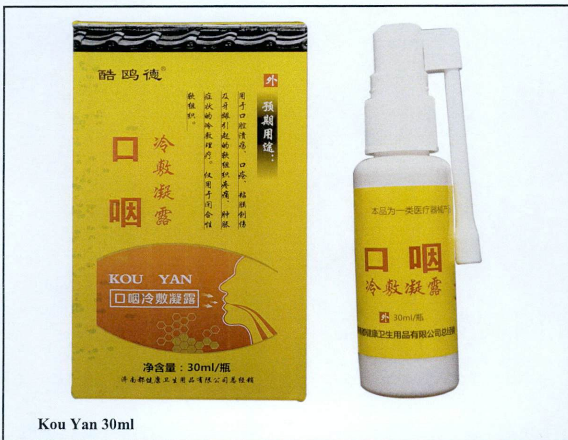
Kou Yan 30ml

The Food and Drug Administration (FDA) advises the public against the purchase and use of the following unregistered drug products: