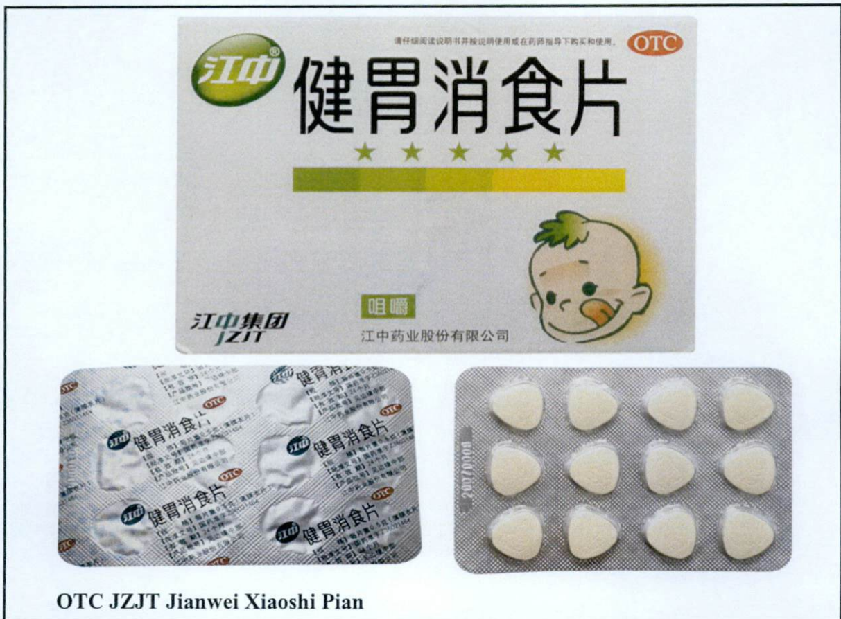
OTC JZJT Jianwei Xiaoshi Pian