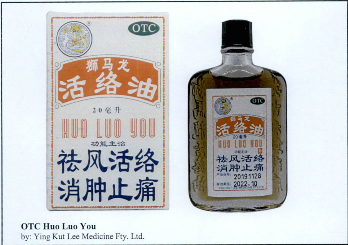
OTC Huo Luo You by: Ying Kut Lee Medicine Fty. Ltd.