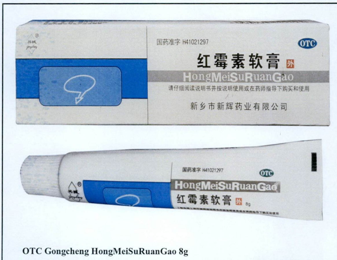
OTC Gongcheng HongMeiSuRuanGao 8g

The Food and Drug Administration (FDA) advises the public against the purchase and use of the following unregistered drug products: