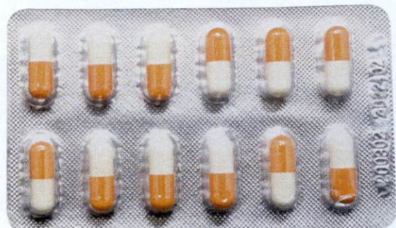
Golden Sun Norfloxacin Capsules 0.1g