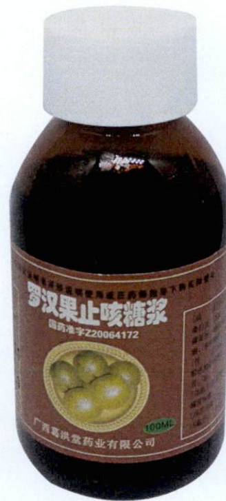
OTC Luohanguo Zhike Tangjiang 100ml