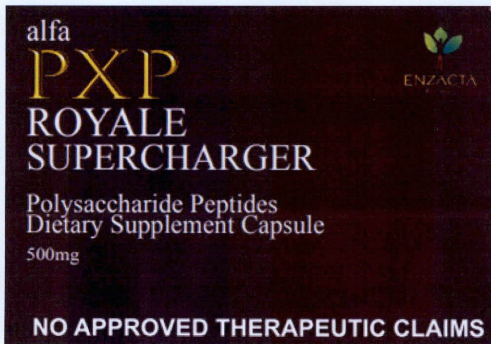
Figure 1. Approved label of ENZACTA ALFA PXP ROYALE SUPERCHARGER Polysaccharide Peptides Dietary Supplement, FR-4000002481692 issued on 12 November 2021 valid until 12 November 2021

The Food and Drug Administration (FDA) informs the public that the food product ENZACTA ALFA PXP ROYALE SUPERCHARGER Polysaccharide Peptides Dietary Supplement has been registered by the Market Authorization Holder (MAH) UNITED ENZACTA ENTERPRISES INC. in accordance to existing FDA rules and regulations.