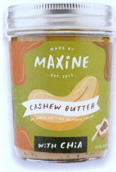
Figure 5. Approved label of MADE BY MAXINE Cashew Butter with Chia, FR-400006642532 issued on 04 January 2021 valid until 04 January 2026 .