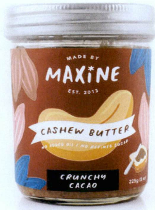
Figure 2. Approved label of MADE BY MAXINE Cashew Butter Crunchy Cacao, FR-400006641744 issued on 08 March 2021 valid until 08 March 2026 .