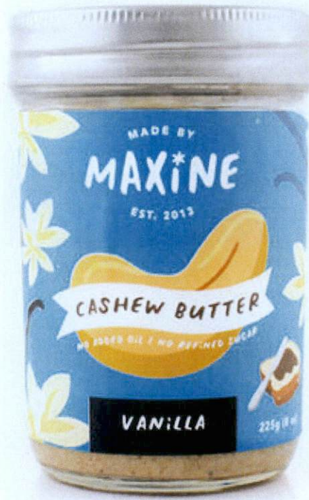
Figure 4. Approved label of MADE BY MAXINE Cashew Butter with Vanilla, FR-400006642369 issued on 04 January 2021 valid until 04 January 2026 .