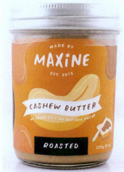
Figure 1. Approved label of MADE BY MAXINE Cashew Butter Roasted Spread, FR-4000006642486 issued on 08 March 2021 valid until 08 March 2026 .

The Food and Drug Administration informs the public that the following food products has been registered by the Market Authorization Holder (MAH) Sikat Araw Trading Corporation in accordance to existing FDA rules and regulations.