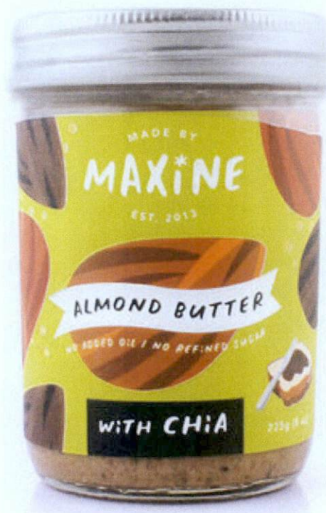
Figure 3. Approved label of MADE BY MAXINE Roasted Almond Butter with Chia, FR-400006641294 issued on 08 March 2021 valid until 08 March 2026 .