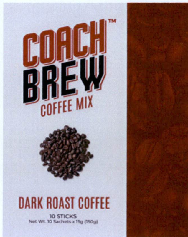
Figure 1. Approved label of COACH BREW Coffee Mix, FR-4000007366987 issued on 01 February 2021 valid until 01 February 2023

The Food and Drug Administration (FDA) informs the public that the food product COACH BREW Coffee Mix has been registered by the Market Authorization Holder (MAH) NINO ANDRELIX NAVARRO GENERAL MERCHANDISE in accordance to existing FDA rules and regulations.