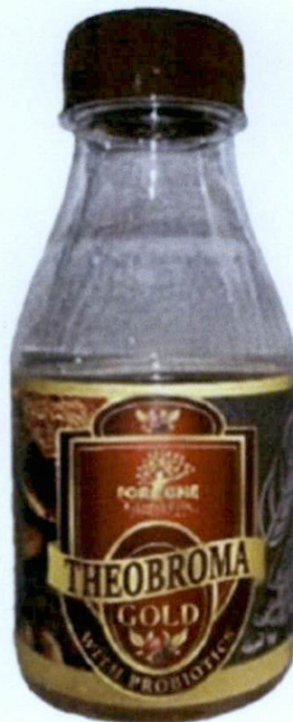
Figure 1. Approved label of THEOBROMA GOLD Cacao Drink Mix with Vitamins & Minerals, FR-4000006762120 issued on 16 October 2020 valid until 16 October 2022

The Food and Drug Administration (FDA) informs the public that the food product THEOBROMA GOLD Cacao Drink Mix with Vitamins & Minerals has been registered by the Market Authorization Holder (MAH) D.C.G.S. ENTERPRISE in accordance to existing FDA rules and regulations.