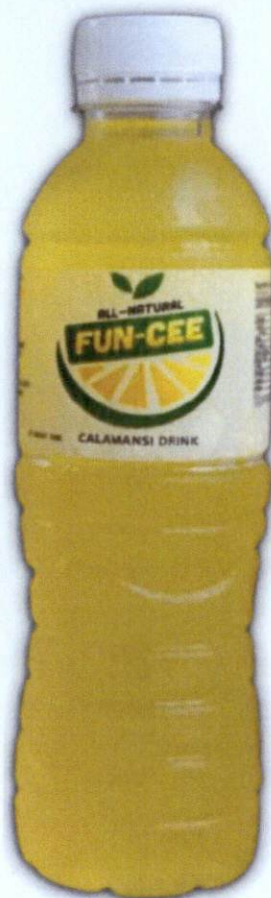
Figure 1. Approved label of FUNCEE Calamansi Juice Drink, FR-4000007556618 issued on 19 March 2021 valid until 01 February 2023

The Food and Drug Administration (FDA) informs the public that the food product FUNCEE Calamansi Juice Drink has been registered by the Market Authorization Holder (MAH) ARPAMAX FOOD AND BEVERAGES in accordance to existing FDA rules and regulations.