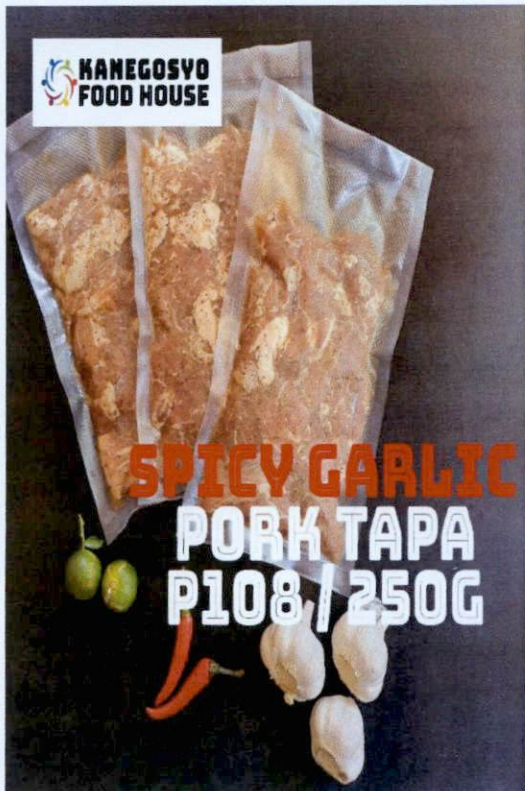
Figure 4. Unregistered KANEOSYO FOOD HOUSE Spicy Garlic Pork Tapa, 250g