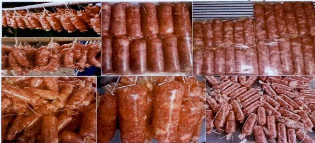
Figure 1. Unregistered MMA MARKETING Lucban Longganisa