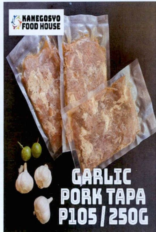
Figure 5. Unregistered KANEOSYO FOOD HOUSE Garlic Pork Tapa, 250g