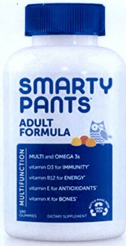
Figure 2. Unregistered SMARTY PANTS Adult Formula Multifunction Dietary Supplement, 180 Gummies