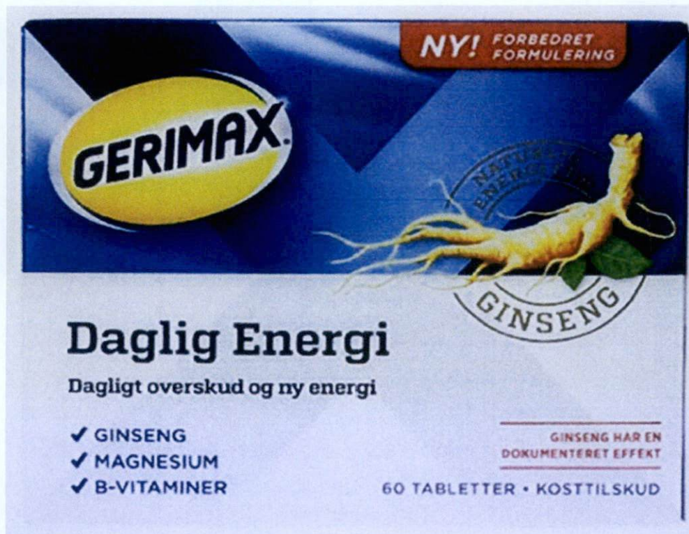
Figure 4. Unregistered GERIMAX Daglig Energi (Ginseng + Magnesium +B-Vitaminer), 60 Tablets (In White and Blue colored Box) (Labels are in foreign language)