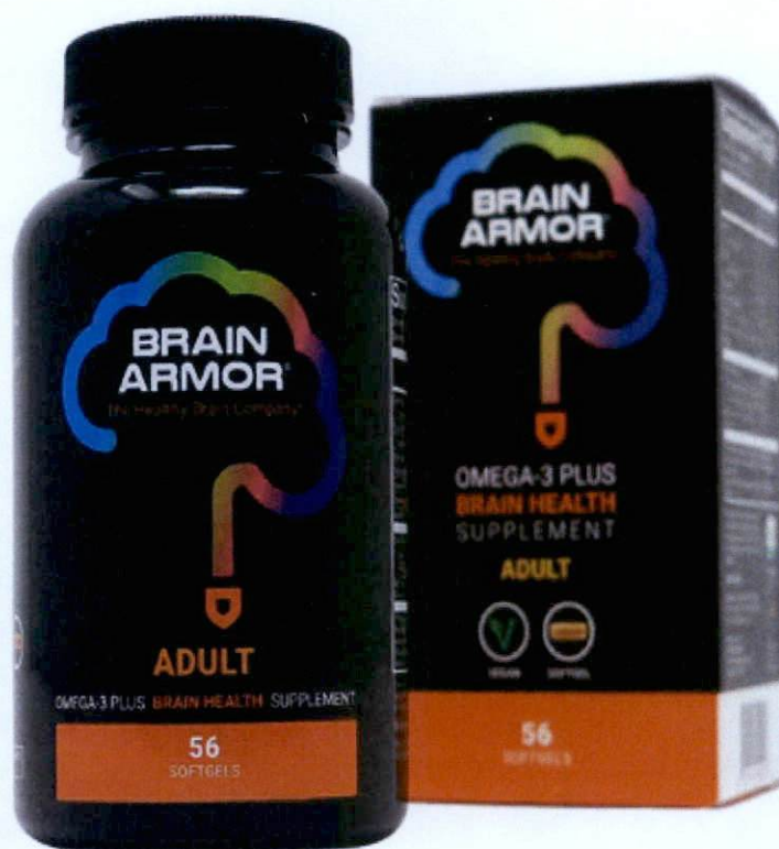
Figure 5. Unregistered BRAIN ARMOR Omega-3 Plus Adult Brain Health Supplement, 56 Softgels

The FDA verified through post-marketing surveillance that the abovementioned food supplements are not registered and no corresponding Certificates of Product Registration (CPR) have been issued. Pursuant to the Republic Act No. 9711, otherwise known as the “Food and Drug Administration Act of 2009”, the manufacture, importation, exportation, sale, offering for sale, distribution, transfer, non-consumer use, promotion, advertising or sponsorship of health products without the proper authorization is prohibited.