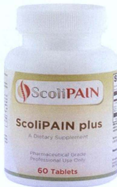
Figure 1. Unregistered SCOLIPAIN – Scolipain Plus - A Dietary Supplement, 60 Tablets

The Food and Drug Administration (FDA) warns all healthcare professionals and the general public NOT TO PURCHASE AND CONSUME the following unregistered food supplements: