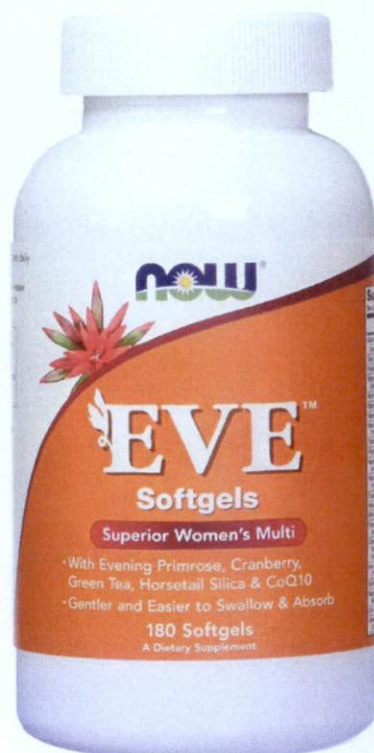
Figure 5. Unregistered NOW Eve Softgels - Dietary Supplement, 180 Softgels