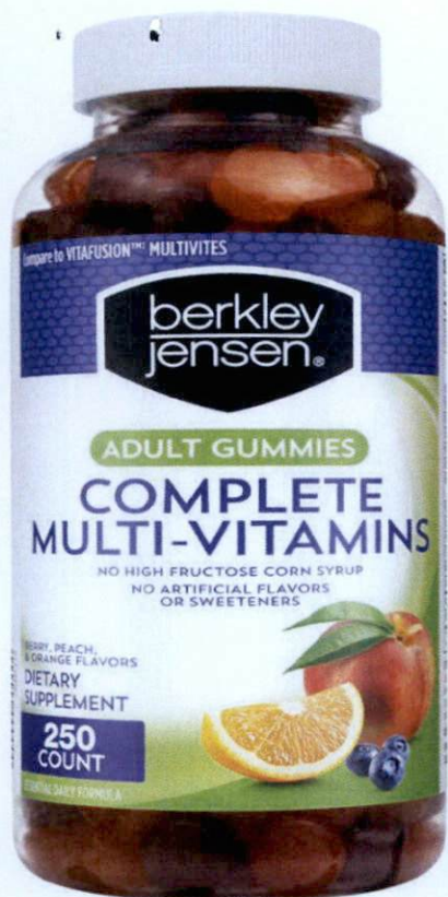
Figure 2. Unregistered BERKLEY JENSEN Adult Gummies Complete Multi-Vitamins Berry + Peach & Orange Flavor Dietary Supplement, 250 Count