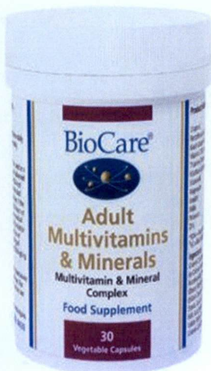
Figure 4. Unregistered BIOCARE Adult Multivitamins & Mineral Complex Food Supplement, 30 Vegetable Capsules