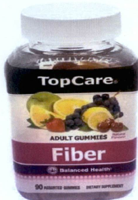
Figure 1. Unregistered TOPCARE Adult Gummies Fiber – Natural Flavors Dietary Supplement, 90 Assorted Gummies

The Food and Drug Administration (FDA) warns all healthcare professionals and the general public NOT TO PURCHASE AND CONSUME the following unregistered food supplements: