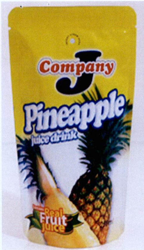
Figure 2. Unregistered COMPANY J Pineapple Juice Drink, 250ml