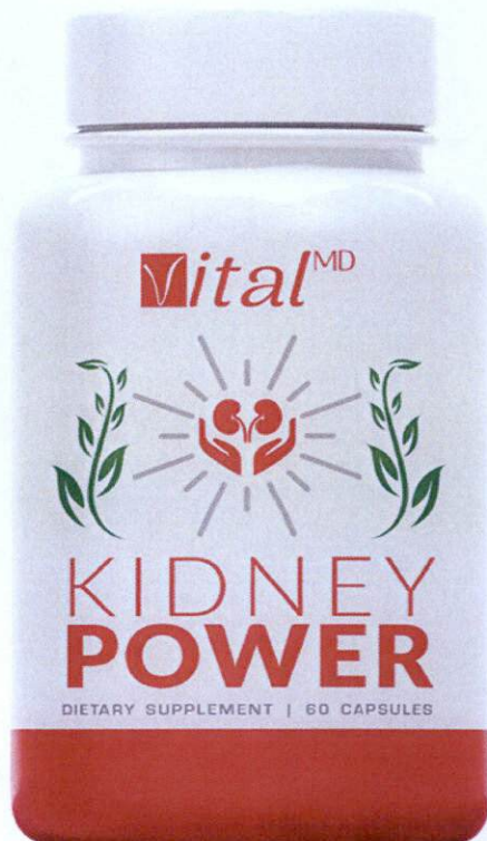
Figure 5. Unregistered VITAL MD Kidney Power Dietary Supplement, 60 Capsules