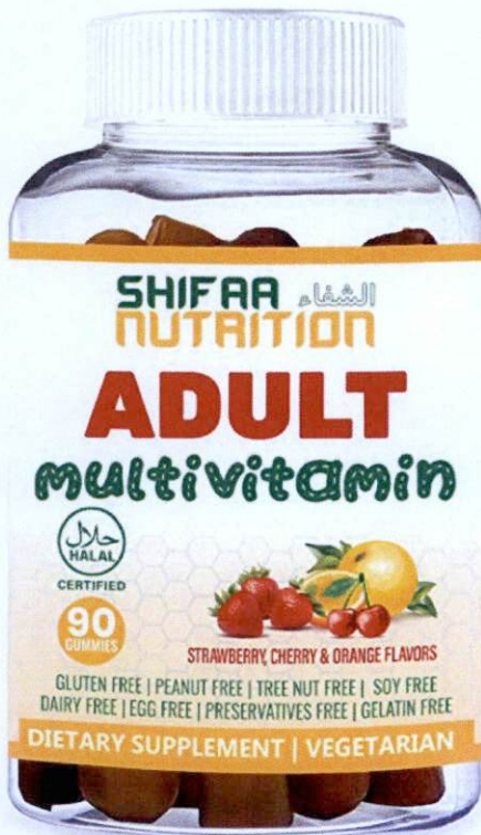
Figure 4. Unregistered SHIFAA NUTRITION Adult Multivitamin – Strawberry, Cherry & Orange Flavors Dietary Supplement, 90 Gummies | Vegetarian