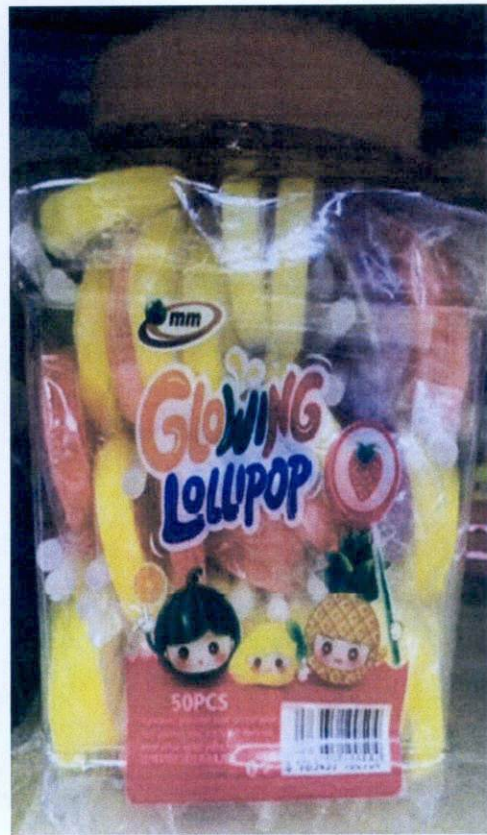
Figure 3. Unregistered MM Glowing Lollipop, 50pcs