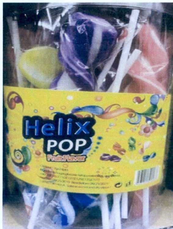
Figure 1. Unregistered HELIX Pop Fruit Flavor

The Food and Drug Administration (FDA) warns all healthcare professionals and the general public NOT TO PURCHASE AND CONSUME the following unregistered food products and food supplements: