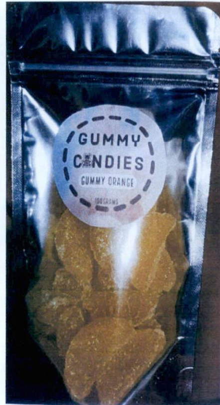
Figure 5. Unregistered GUMMY CANDIES Gummy Orange, 100grams