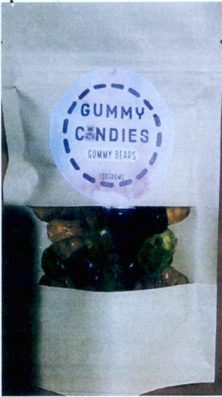
Figure 2. Unregistered GUMMY CANDIES Gummy Bears, 100grams