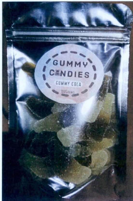
Figure 1. Unregistered GUMMY CANDIES Gummy Cola, 100grams

The Food and Drug Administration (FDA) warns all healthcare professionals and the general public NOT TO PURCHASE AND CONSUME the following unregistered food products and food supplements: