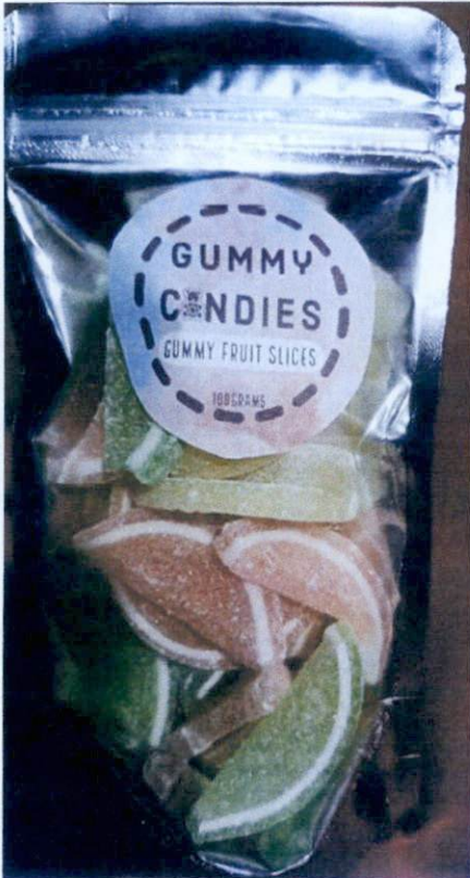
Figure 4. Unregistered GUMMY CANDIES Gummy Fruit Slices, 100grams