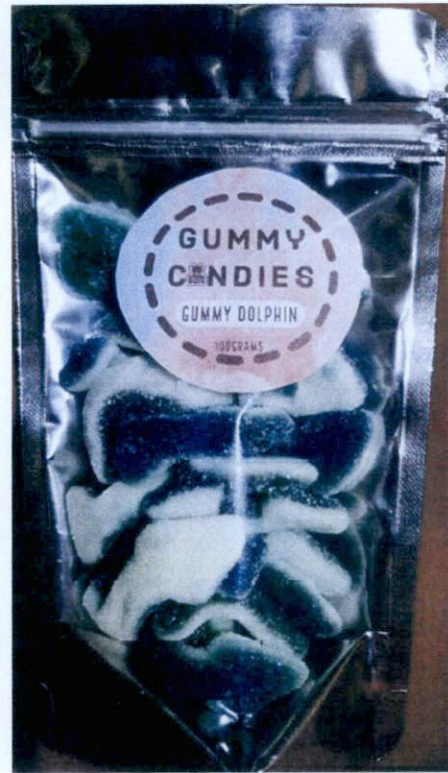
Figure 3. Unregistered GUMMY CANDIES Gummy Dolphin, 100grams