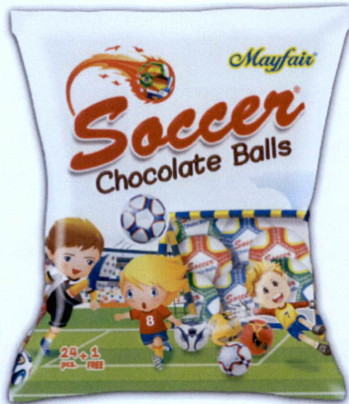
Figure 1. Approved label of MAYFAIR Soccer Chocolate Balls, FR-4000007286263 issued on 09 March 2021 valid until 14 August 2025 .

The Food and Drug Administration (FDA) informs the public that the food product MAYFAIR Soccer Chocolate Balls has been registered by the Market Authorization Holder (MAH) SUCERE FOODS CORPORATION in accordance to existing FDA rules and regulations.