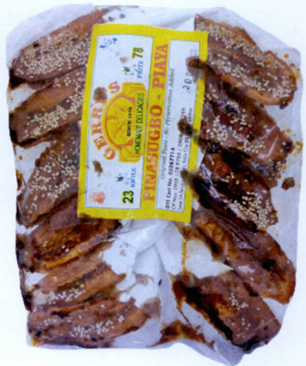
Figure 5. Unregistered GERRY'S Pinasugbo