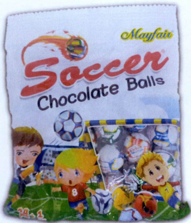
Figure 4. Unregistered MAYFAIR Soccer Chocolate Balls