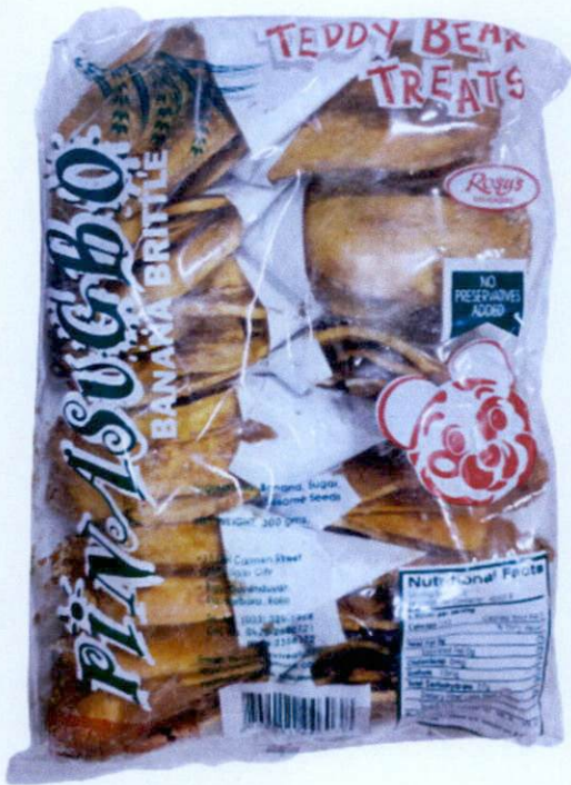
Figure 2. Unregistered ROSY'S DELICACIES Teddy Bear Treats Pinasugbo Banana Brittle