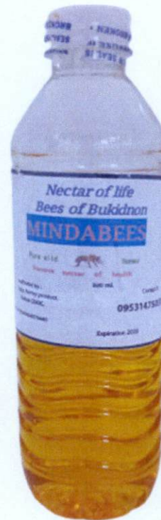
Figure 3. Unregistered MINDABEES Nectar of Life Bees of Bukidnon Pure Wild Honey